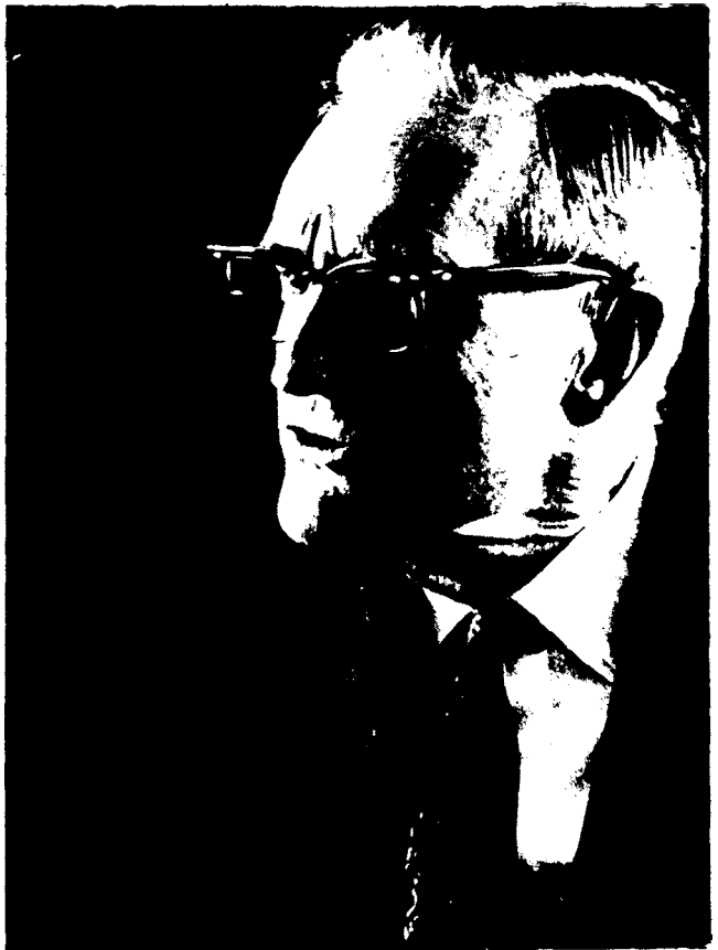
John D. Rockefeller, III