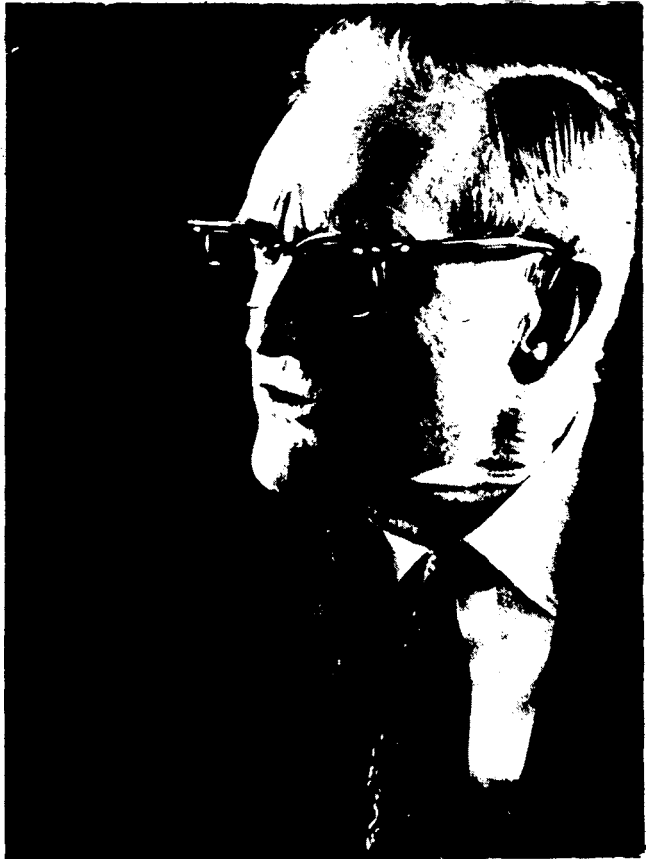
John D. Rockefeller, III