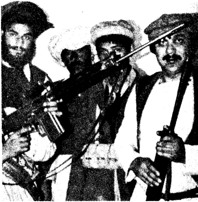
Drug-running Afghan rebels: part of the Crescent.

stan has sharply declined. The DEA estimated that Pakistan's illicit opium harvest from 1980 yielded 125 metric tons, and 126 metric tons was expected from the 1981 harvest. State Department officials and intelligence sources have cited the political instabilities of the region as the primary factor in bringing down production, specifically the fall of the Shah in Iran, the Soviet invasion of Afghanistan, and the massive influx of Afghan refugees and rebels to Pakistan's Northwest Frontier Province. Reportedly the drop in the price of raw opium also was a contributing factor in the cutbacks.