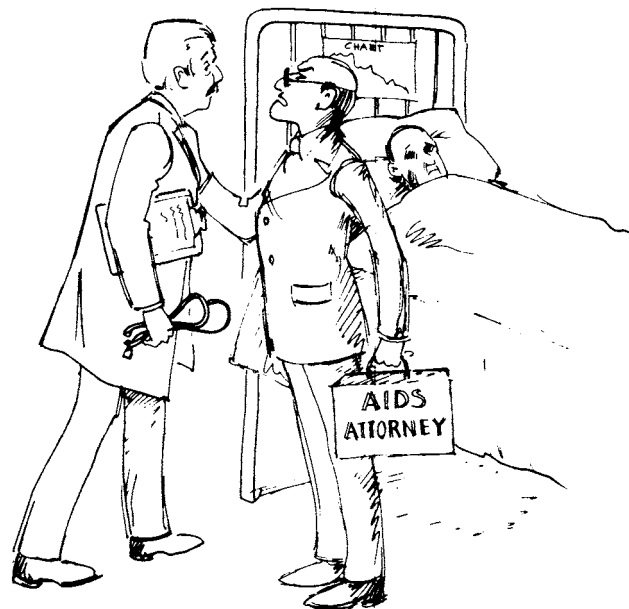
Stop right there—I represent the virus

Oct. 29, 1986: Joseph Cardinal Ratzinger issues a letter,