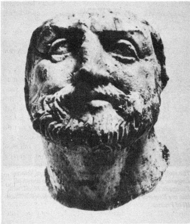
Greek Ministry of Culture and Sciences