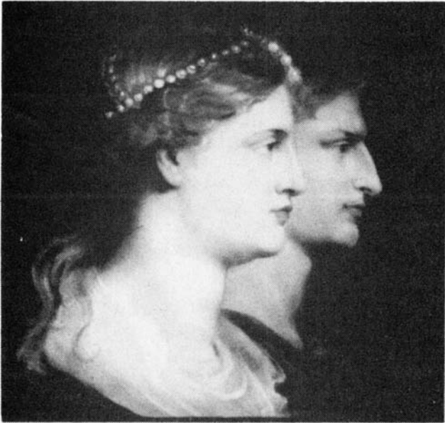
National Gallery of Art

The evil within European culture is symbolized by the Emperor Tiberius, who ordered the execution of Christ (Tiberius and Agrippina, by Rubens).