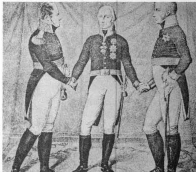
The Holy Alliance, established at the 1815 Congress of Vienna. Emperor Alexander I of Russia, left, was assigned to drown all European sympathies for the American Revolution in blood; with him are Emperor Franz I of Austria, and King Frederick-William III of Prussia.

Forget the popularized, but worse than useless apotheosis of seating arrangements—right, center, left—in the French