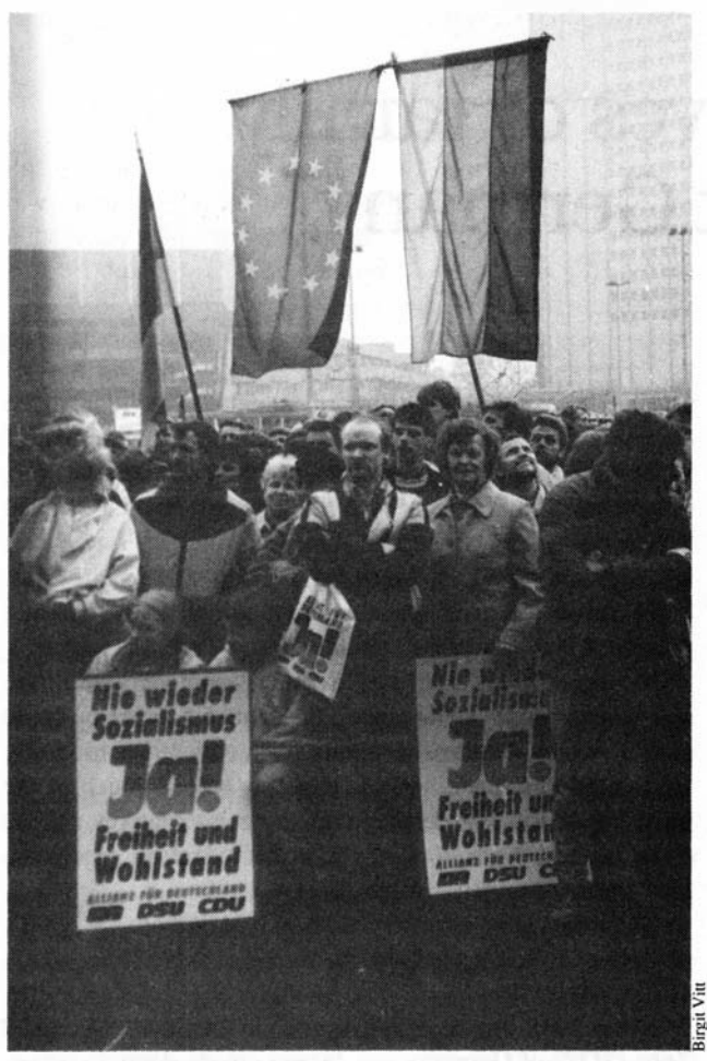
"Never again socialism!" read the banners at this 300,000-strong electoral rally on March 16, addressed by West German Chancellor Helmut Kohl in Leipzig, two days before the East Germans voted the Marxists out of power. One of the first socialist measures that must be undone, is rural collectivization.