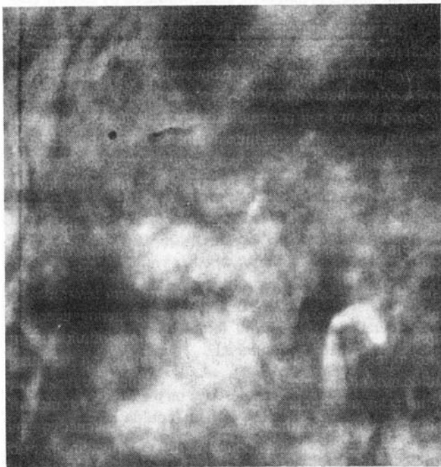
FIGURE 2 A wormlike feature of unfamiliar structure

What is the wormlike feature to the right of the black dot? Has anything like it been seen before? Within its head are two well-defined dark points. In the original image, the structure does not, apparently, terminate at this head, but continues in very faint outline to the left and downward, ending like the large end of a crook-necked squash. To the lower left is the star and finger of gas shown in Figure 1.