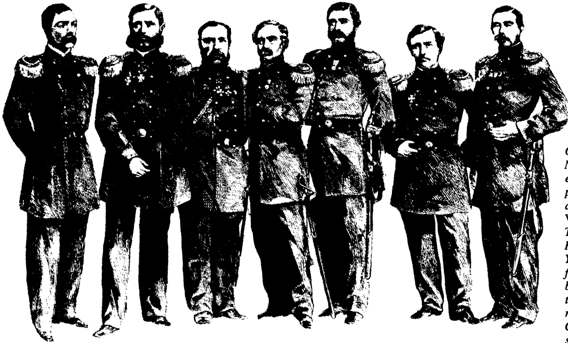
Officers of the Russian Navy in New York City, engraved from a photograph which appeared in Harper's Weekly, Nov. 7, 1863. The arrival of the Russian fleet in New York and San Francisco forced Great Britain to back down from its plan to attack the Union and recognize the Confederacy as a separate state.

Americans: It was Russia's military weight and threats of reprisals against Britain and France, that prevented any British-led intervention against the Union.