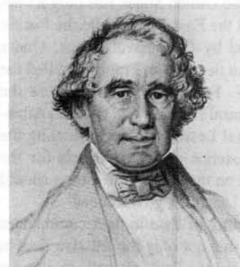
American System economist Henry C. Carey. His views were well known in Russia, and formed the policy foundation of the Russian-American alliance.