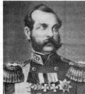
Czar Alexander II: "I shall accept the recognition of the independence of the Confederate States by France and Great Britain as a casus belli ."