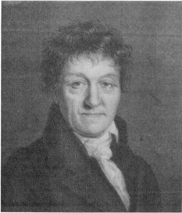
Lazare Carnot: Known as the “author of victory,” he was a soldier-scientist who led a science-driver effort in France from 1793-1814.

For educational purposes, some of the best demonstrations of this principle may be taken from the domain of military or space programs. The educational merit of such examples is that neither involves an end-product for producers’ or households’ consumption on earth; yet, the highest rates of growth have often been derived from what many would regard as exercises in economic waste. To produce the military or space-economy articles, the components of the program must be built, of course. The distinction of these components of a science-driver military or space program is that a relatively very large ration of the product requires use of new technologies, and that at a relatively high rate of technological obsolescence.