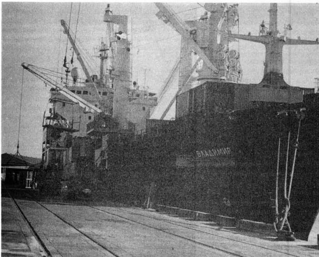
The Soviet ship Vladimir in the Houston harbor in 1989. For Russia's economy to recover, it must trade, that it may secure what it must import in order to produce. Its best potential for exports lies in the capacity of its scientific cadres to develop new technologies, and the capital-intensive potentialities of the military-industrial and aerospace complexes.

teenth-century industrial development of Russia under the reforms which Leibniz supplied to Peter the Great; the United States' experience; the case of France under the guidance of Lazare Carnot and Monge's 1794-1814 Ecole Polytechnique; Germany under the combined impact of Friedrich List's American System of political-economy and of the Humboldt brothers' reforms in science and education; the policies of Russia under Czar Alexander II, Dmitri Mendeleev, and Count Sergei Witte; and the Meiji restoration's economic revolution in Japan, based directly upon the advice of anti-free trade American System economists Henry C. Carey and his student E. Peshine Smith.