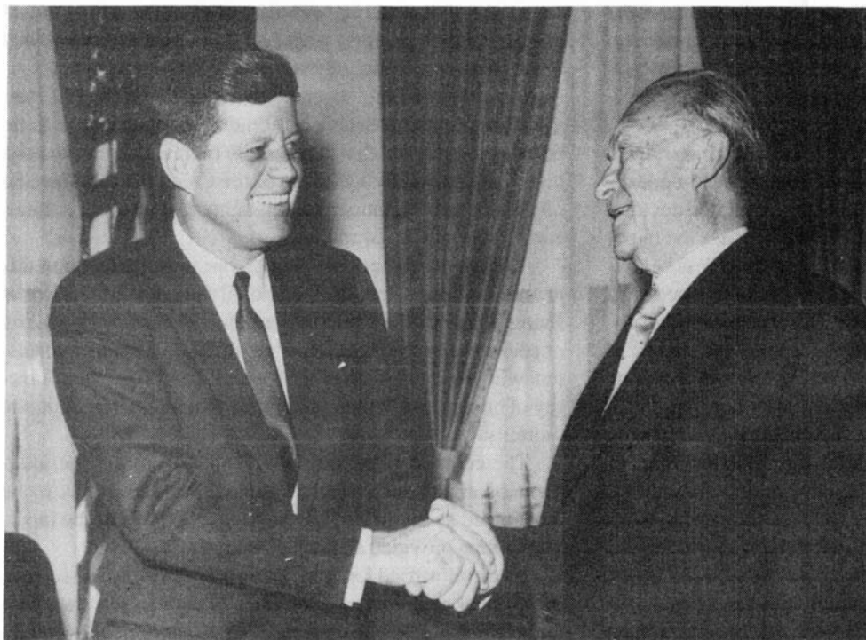
President John F. Kennedy receives German Chancellor Konrad Adenauer in Washington, April 12, 1961. The initiatives of the early 1960s associated with Kennedy, Adenauer, and de Gaulle created the upward trends in economy which were disastrously reversed beginning in 1964-67, and continuing to the present day.

combined categories of agriculture, manufacturing, basic physical infrastructure, medicine, education, science, and technology, must be increased at the expense of the excessive and unwholesome aggregations which have piled up within the categories of sales, administration, bureaucracy, unemployment, and sin.