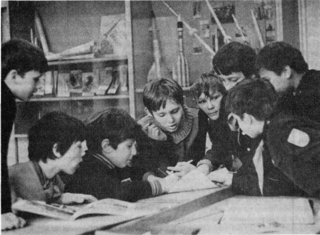
Children during the Soviet era study rocket science. Today, Russia's capabilities in science and technology, particularly the space program, provide the best means for achieving economic stabilization and development.

Although we are focused upon the subject of Russia, only charlatans could speak of the future of Russia without taking into account explicitly the factors which are of immediately decisive importance for each and all nations of this planet. Indeed, the present crisis within Russia (as of all of eastern Europe) is a relatively mild form of the catastrophe which is soon to strike down every nation upon this planet. The way we treat the problems of Russia today is the mirror of the early to medium-term future of China, Japan, North America, and western Europe. . . .