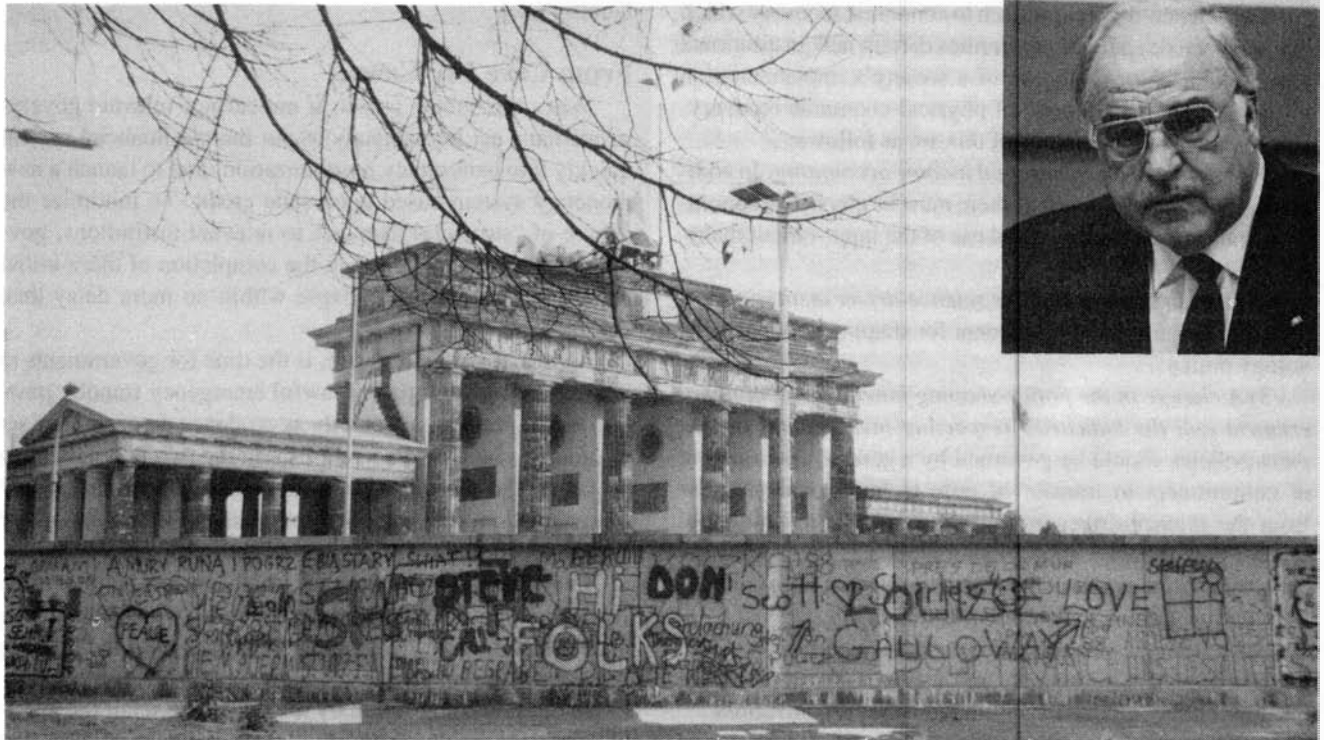
The Berlin Wall and the Brandenburg Gate, before the fall of the communist regimes. German Chancellor Helmut Kohl (inset) took the executive action required to ensure the reunification of Germany. To handle the crises that now lie before us, heads of state will have to step forward with a clear and competent program of action.

to a public act of political suicide by the government as a whole, if it did not incite an instant popular, and very bloody revolution.