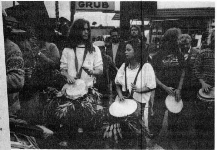
An April 13, 1990 war cry from Earth First! to "save all trees" called for a "war" against the timber companies in northern California (left). "We intend to spike trees, monkeywrench, and even resort to violence if necessary," they boasted. Right, Earth First!ers beat the war drums in this photo taken in northern California three months later.

erations, who were fighting for their lives against determined saboteurs, who claimed logging, mining, and ranching as a threat to "biodiversity."