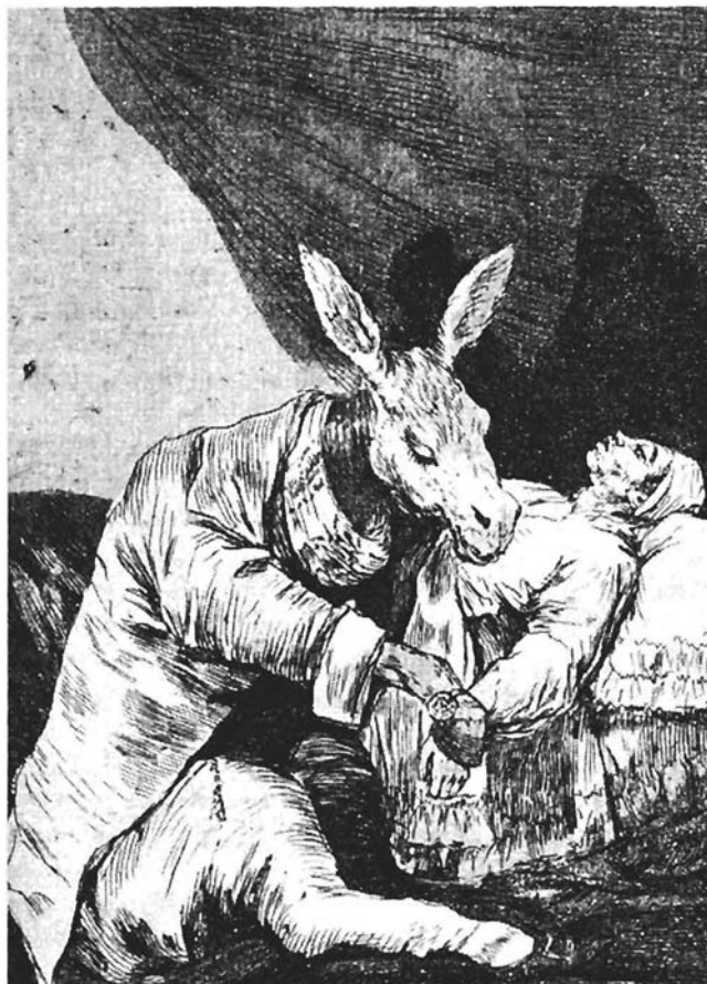
From Francisco Goya’s “Caprichos”: “Of what ill will he die?” Goya asks. “The doctor is excellent, pensive, considerate, calm, serious. What more can one ask for?”

So, only by rejecting the sickness of volunteered slavery, can genocide be stopped. Goya’s etching (see picture on this page) shows a doctor who is treating a patient, and the caption says, “Of what illness will the patient die?” We will not be saved by the rhetoric of multicultural nationalism; we will not be saved by the rhetoric of secessionism; we must change how we think , because, after all, if you are sick, and you are treated by someone who has illusions—someone who is an ass— of what illness will you die?