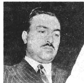
Adam Clayton Powell

The African-American Congressman Adam Clayton Powell was the most significant legislator in the United States after the American Civil War of 1860-65. Powell was a legislator, he was a Congressman from the 1940s, just after the war, up until approximately 1970. Adam Clayton Powell, who attended the Bandung Conference of 1955, pointed out the little-appreciated fact, that when that conference was held, Indonesia's President Sukarno, in his opening of the conference, invoked the American Revolution as the model for the creation of the Third World. Sukarno declared: