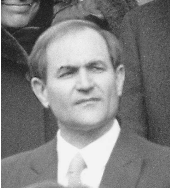
Virginia Gubernatorial candidate James Gilmore III, front-man for the Bush-Robertson-North fascist political machine. Also shown here is a brochure from Virginia Correctional Enterprises, advertising the benefits of slave labor in the prison system, for employers seeking a docile and low-paid workforce.