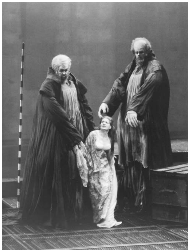
Romanticism is the creation of sensual, erotic effects—unlike Classical composition, which expresses ideas. Shown here: a scene from Wagner's "Das Rheingold," on PBS television, 1983. Wagner "gave up music in order to make bombs on stage," says LaRouche.

But Classical composition is important to us, whereas Romantic is not. Modern music is not necessary; put it out in the trash, where it would be happy, by itself. Popular music, as it has developed recently: Put it in the trash, it doesn't belong, it doesn't do anybody any good.