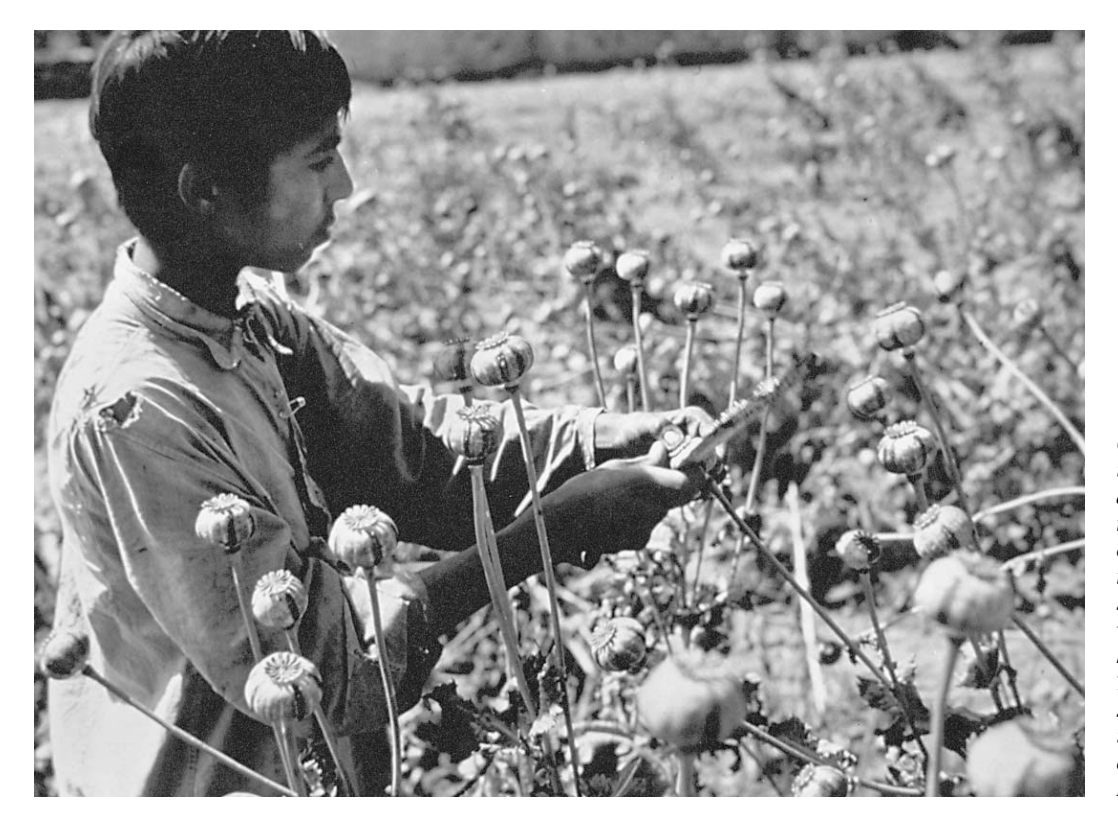
Opium poppy cultivation in Pakistan. While the drug legalizers claim that the war on drugs cannot be won, in fact there has been significant progress, where serious efforts have been undertaken. The UN reports notable successes in narcotics interdiction as a result of cooperation between India and Pakistan.

civil war in order to expand their operations in Angola." As a result, "The Board encourages the Government of Angola to strengthen customs controls at its airports and seaports, as well as the control of its border with the Democratic Republic of the Congo, and to request international assistance to that end."