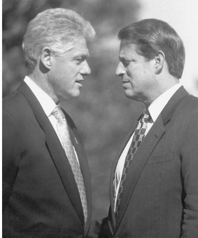
"One very real, leading danger, which could be a result of replacing President Clinton with Al Gore," writes LaRouche, "is the not unlikely danger of outbreaks of thermonuclear-missiles launches in the near future, if the impeachment goes through."

Black's Hollinger Corporation, and London's Lord William Rees-Mogg, against everything good this republic ever represented. 6 Ours is a fight against a British parliamentary-style coup d'état, orchestrated from