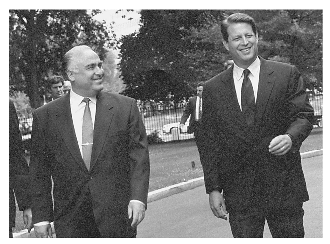
Vice President Al Gore and then-Prime Minister Viktor Chernomyrdin of Russia, on June 23, 1994, shortly before a joint press conference by the two leaders of the Gore-Chernomyrdin Commission.

the Democratic Party to mobilize its traditional core constituency during the 1994 mid-term elections, which saw the Newt Gingrich-led Republican Party Conservative Revolutionists seize the majority in both the House and the Senate, by the narrowest of margins. Kennedy himself had conducted a traditional "FDR-JFK" campaign and won re-election. He addressed this issue at the Press Club: "The election last November was not a ratification of Republican solutions. By the narrowest of margins they gained control of Congress. But less than 40% of the eligible voters turned out on Election Day, and only slightly more than half of those—about 20%—cast ballots for Republicans."