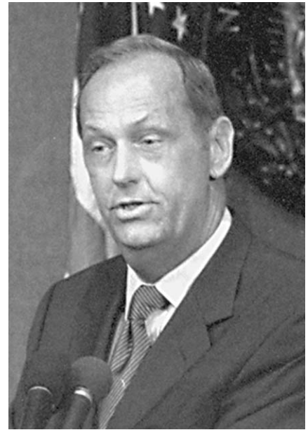
Left to right: George W. Bush (“not the sharpest knife in the drawer”); Al Gore, Jr. (his campaign staffers are heading for the hills); Bill Bradley (he has them “sleeping in the aisles”).

money machine has about $350,000, and Gore is trailing, with about $242,000.