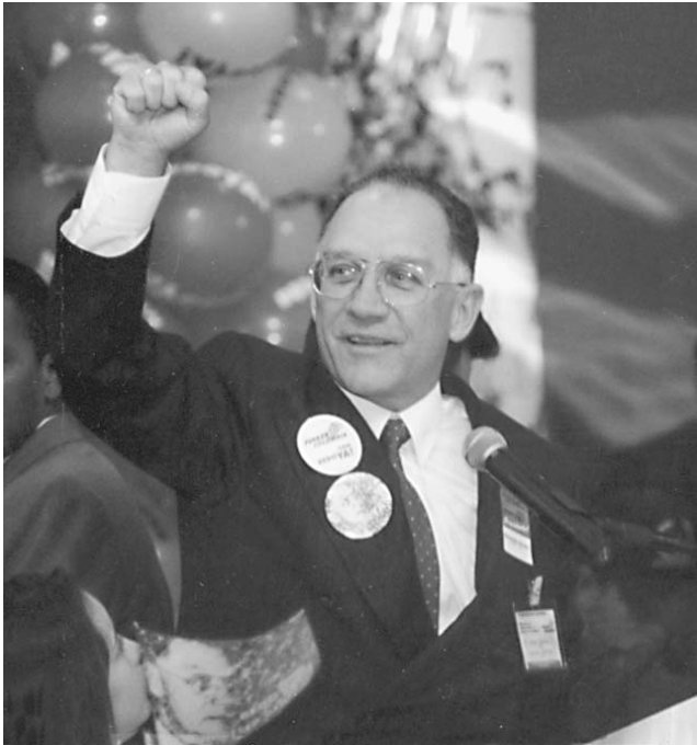
Gen. Harold Bedoya, during his campaign for the Colombian Presidency in 1998.

of Iranians, Uruguayans, Argentines, Paraguayans, and other nationalities. The existence of this advisory group, Bedoya insisted, proves that these mafias have a continental strategy.