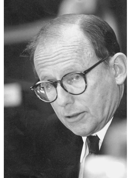
Among the ghouls of the Trilateral Commission, left to right: Henry Kissinger, Zbigniew Brzezinski, and Samuel Huntington.

trolled disintegration”—the idiotic term employed by the BAC to describe the crisis management of the nation-states they set out to destroy—the Trilateral outlook has produced a new phase of “uncontrolled” chaos. The “Islamic fundamentalist card” against Russia has taken on a life of its own, as BAC-inspired terrorism and the reaction to it move the world closer toward world war.