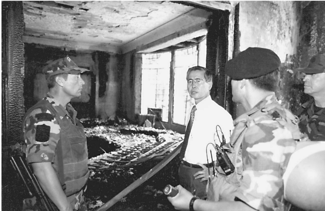
“The experience of Peru,” says LaRouche, “and the difficulties and menace that Peru faced, from narco-terrorism in Peru, shows that we do know how to do these things, even in tough situations like that.” Here, Peruvian President Fujimori inspects the interior of the Japanese diplomatic residence in Lima on April 23, 1997, after the government raid on MRTA terrorists holding hostages there.