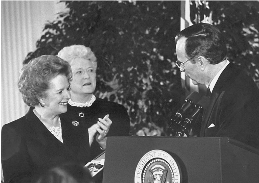
Margaret Thatcher receives the Medal of Freedom from George Bush, March 7, 1991, after Operation Desert Storm. Thatcher and Bush imposed austerity conditionalities upon Russia, which were intended to destroy the former Soviet economy—with the genocidal effects we see today.

middle of the 1970s, under civil rights influence, we had an improvement in the degree of representation of African-Americans. Beginning about the middle of 1975, particularly with the accession of Rehnquist at the Supreme Court, as an Associate Justice then, we've had a reversal in that trend, and we've had massive persecution, attempts to eliminate the African-American from effective political influence. And that's one of the things I want to reverse.