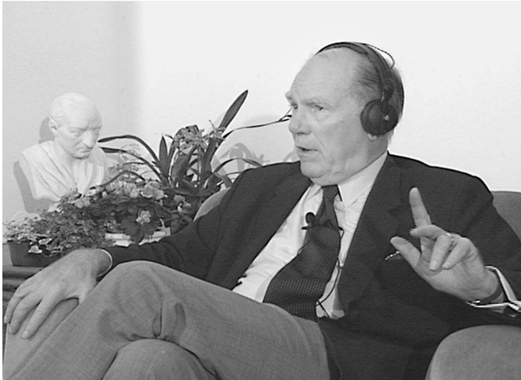
U.S. Presidential pre-candidate Lyndon H. LaRouche, Jr. addresses a panel of U.S. state legislators and trade union officials on Sept. 3, by telephone from Germany. Starting with his Oct. 13 press conference, which was broadcast live over the Internet, he will be addressing citizens in this manner on a regular basis.

Clinton signed the Fiscal Year 2000 defense bill into law, in which the U.S. military defense spending increased for the first time since the Cold War. And China thinks there are some anti-Chinese articles in the bill, and opposed it.