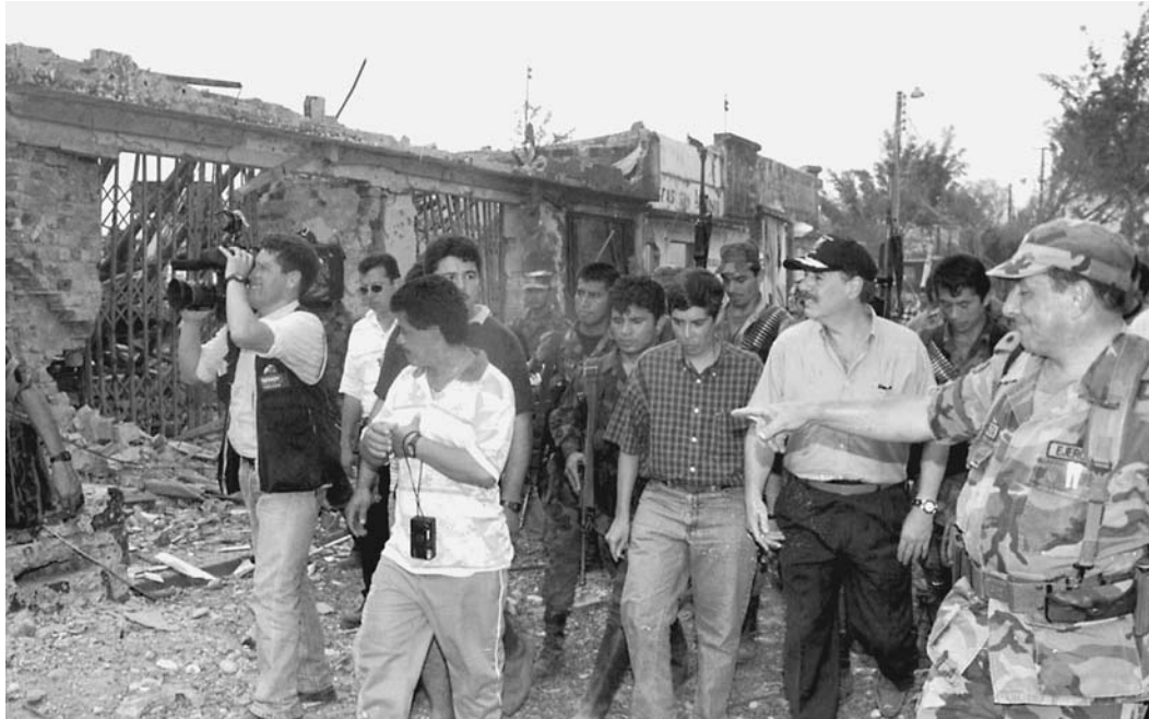
Colombian President Andrés Pastrana tours a region demolished by the FARC narco-terrorists, July 1999. Colombia is a dramatic case of the disintegration of the nation-state, as, with the blessings of the City of London and Wall Street, half of the national territory has been handed over to the FARC.

Today, a decade later, LaRouche's prophetic warnings are playing out on every continent, as the London-headquartered forces of world oligarchism conduct an unrelenting, multi-faceted assault against the nation-state.