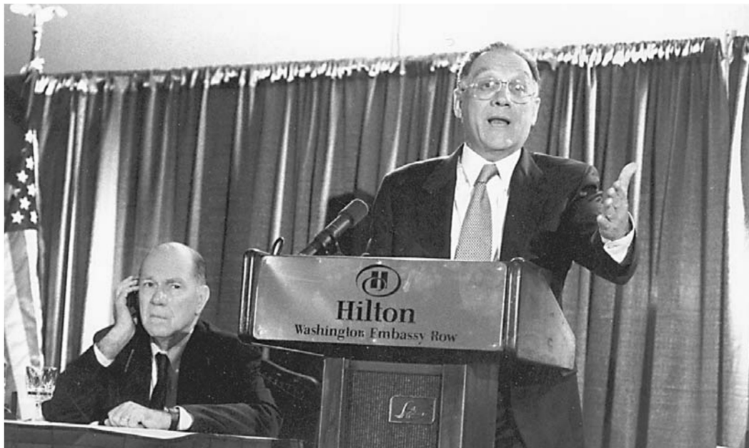
Lyndon LaRouche and Gen. Harold Bedoya (ret.) (at podium), at a seminar in Washington on Feb. 23. The defense of the nation-state and the principle of the General Welfare, said LaRouche, is “the issue posed immediately by General Bedoya, not as a case, not as Colombia, but as a line in the sand from which no part of humanity must retreat.”

planned also for Germany—by the same British and American people, including the Harriman family, whose Prescott Bush, the grandfather of the present idiot, or “It,” as they call him, George W. Bush, was responsible, together with certain British interests, which he was partner with, in putting Adolf Hitler into power, in January of 1933.