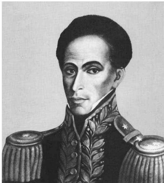
South American revolutionary leader Gen. Simón Bolívar (1783-1830) denounced the corrupting influence of Britain's Jeremy Bentham as the greatest threat to the emerging new sovereign states of the Americas.

For example. As you would learn from a simple, elementary Euclidean geometry, that all the theorems which are considered legitimate in a schoolbook geometry, are derived from acceptance of certain definitions, axioms, and postulates. And in a formal mathematics, or a formal mathematical physics, that's the way all ideas are generated. So therefore, if you