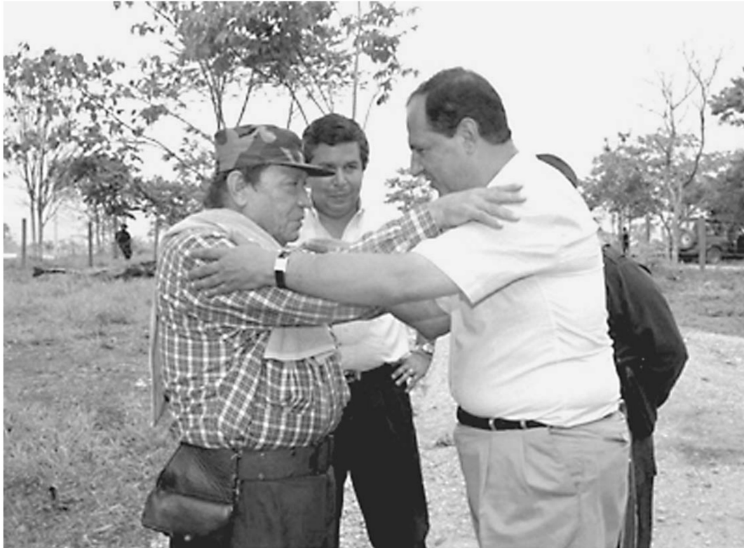
Colombian Finance Minister Juan Camilo Restrepo (right) embraces FARC chieftain Manuel "Tirofijo" ("Sureshot") Marulanda Velez, on Jan. 20, 2000.

Things are fine for them, and that's why they go down to the Caguán jungles, with the latest-style shirts and pants and shoes. But come and see how our peasants are living, and dying. Globalization has destroyed the Colombian economy.