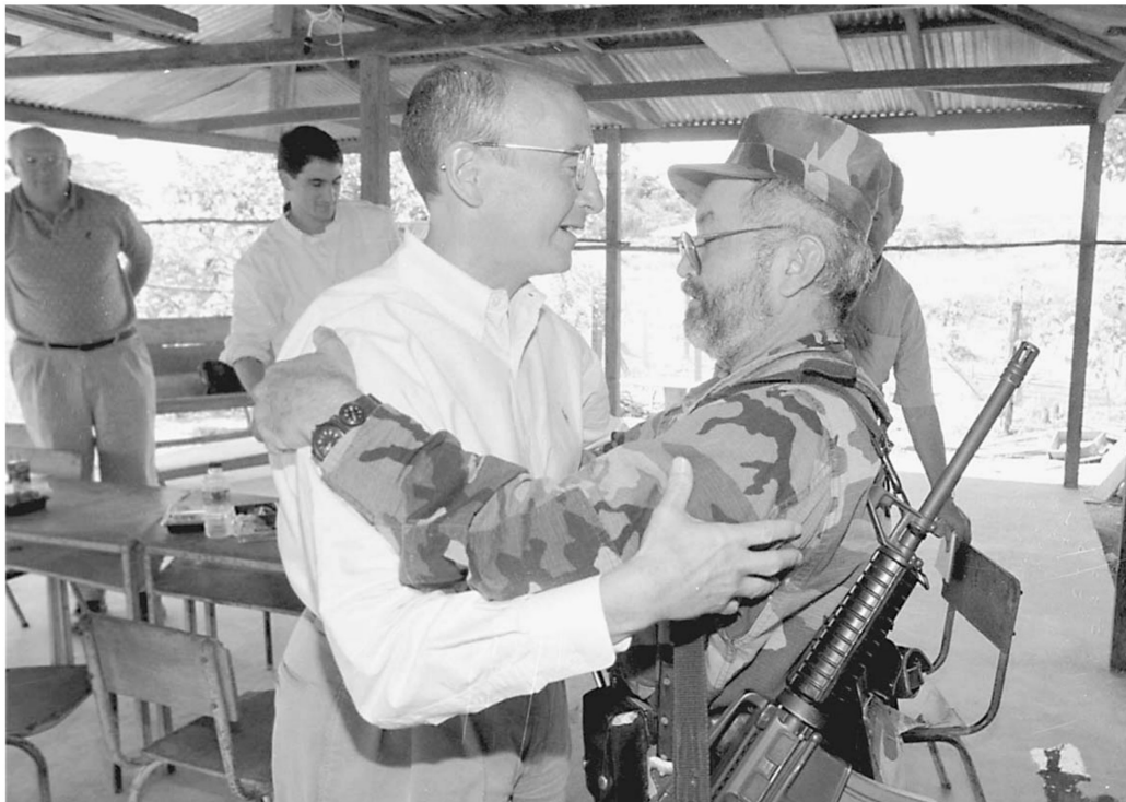
The infamous “Grasso Abrazo”: Richard Grasso, president of the New York Stock Exchange, embraces narco-terrorist Raúl Reyes, head of finances for the FARC, during a June 1999 visit to Colombia.

Grasso, the president of the New York Stock Exchange which manages the whole financial system, all the dollars and finances of the world monetary system, went down to those laboratories, met with the financial chieftain of the drug trade. You can see him there in the photo, hugging Raúl Reyes, a terrorist.