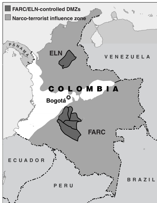
FIGURE 1 Colombia's two narco-DMZs

President Clinton told the world that he wants to recover those territories in the south of Colombia, which are in the hands of the drug trade. Can we look at this map of Colombia? [Figure 1.] I want to show you what President Clinton says he wants to do. He wants to recover this territory in Colombia,