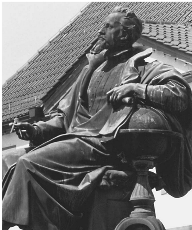
Statue of Johannes Kepler (1571-1620) in Weil der Stadt, Germany.

As the most ancient known Zodiacs indicate, mankind's first systematic astronomy measured the angular changes, not