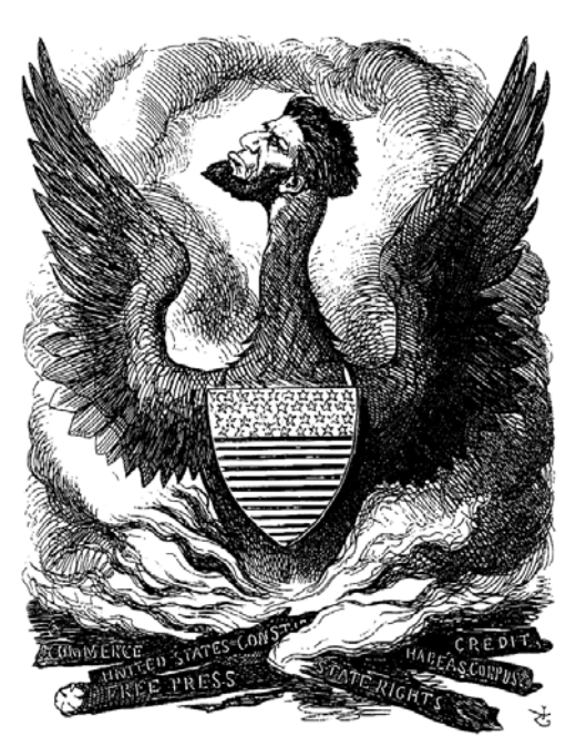
THE FEDERAL PHŒNIX.

FOUND UNDER HIS THUMB, A NEW ORLEANS PLUM, AND SAID WHAT A CUTE YANKER AM I