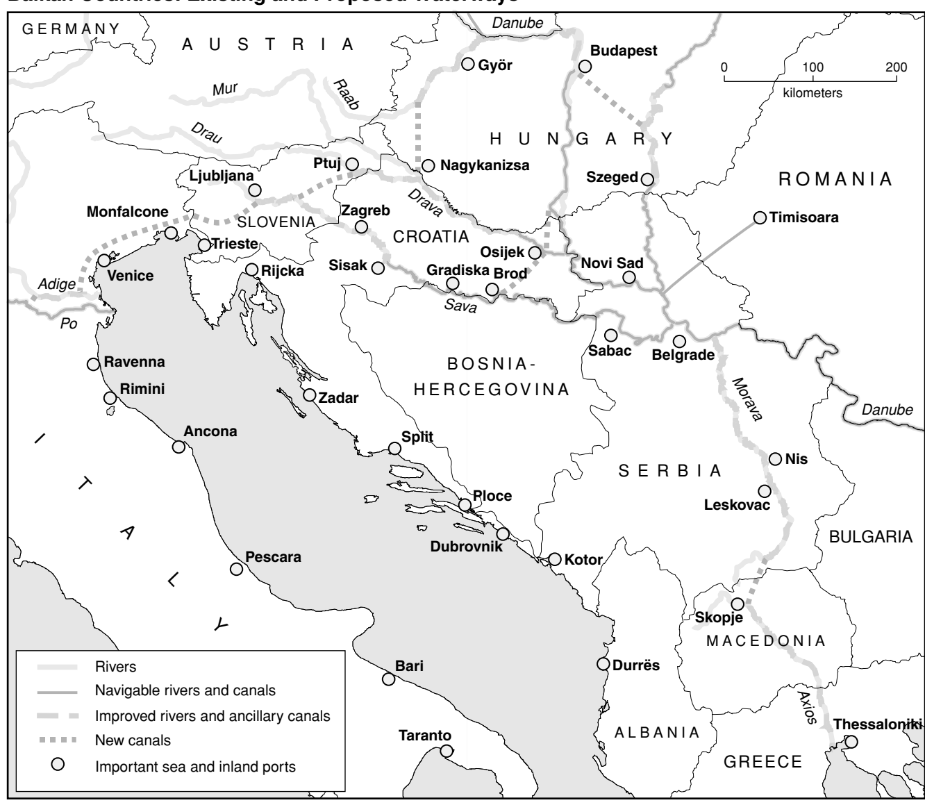
FIGURE 1 Balkan Countries: Existing and Proposed Waterways

firms are specialized in construction of turn-key steel plants, chemical plants, fertilizer plants, cement plants, and power plants, and they are currently suffering under a dramatic shrinkage of orders as a consequence of the crisis in Asia. Unless new factories, and thus new jobs, emerge quickly in Yugoslavia, there will be a new wave of refugees—hundreds of thousands of Serbs, who cannot earn a living in Yugoslavia.