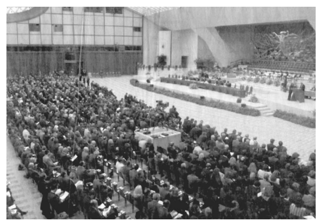
Five thousand Parliamentarians and Congressmen from nearly 100 countries fill the "Paul VI Auditorium" at the Vatican, for the opening session of the Jubilee conference.

Conference, printed an article with quotes from the Pedrizzi motion, announcing that it was to be discussed at the Vatican conference. The same day, a newly created, Catholic-oriented press agency in Rome, Edital, circulated the full text of the motion.