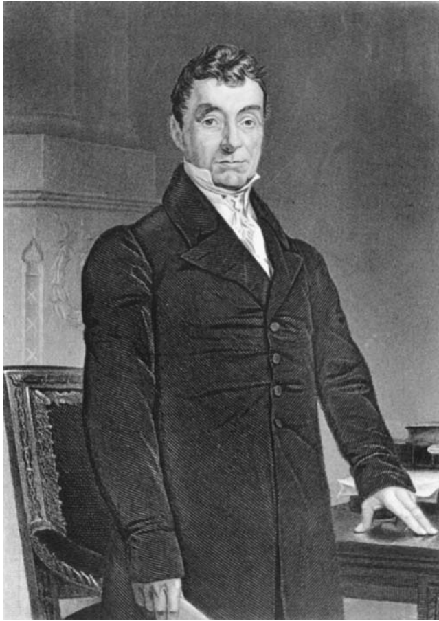
Gen. Marquis de Lafayette, although a hero of the American Revolutionary War and an ally of Bailly, was weakened by his commitment to the aristocracy and the Bourbon royal family, even above the urgent necessity of national sovereignty and survival.

Launay has not recognized the deputations that were sent to him; furthermore it was his duty to call on the city to discuss [the situation] with him.” 17