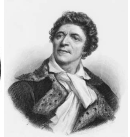
Left to right: Robespierre, whose Reign of Terror beheaded Bailly and many others, as the Revolution was drowned in blood; French Finance Minister Jacques Necker, an agent of Britain's Lord Shelburne. Ironically, after bankrupting France as Finance Minister, Necker was made the hero of the crowds storming the Bastille on July 14, 1789; and the Swiss Jean-Paul Marat, leader of the Jacobins, who was imported from London to attack Bailly and his ally Lafayette.