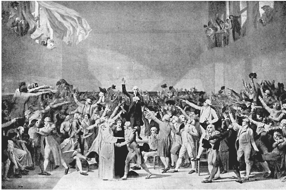
The Tennis Court Oath of June 20, 1789 was the most solemn moment of the French Revolution, in which the National Assembly, led by Bailly, demonstrated its sovereignty, striking a powerful blow against the British and their agent, Finance Minister Jacques Necker. Imitating the American Framers at the Constitutional Convention two years earlier, the French deputies swore not to disband until France had a new Constitution. Here, "The Tennis Court Oath," a painting by Jacques-Louis David (1789). Bailly is the central figure, standing on the table.

Louis XVI's regime was at the financial mercy of Necker and the banking interests he represented, while the population of France was in revolt against the economic collapse and deprivation. Necker's ally, the King's cousin Louis-Philippe Duke of Orléans, was importing British-trained Jacobin radical writers into Paris, turning the Palais Royale district which he personally owned, into an anarchist bastion to overturn the French state. (One such writer, the infamous Jacobin Jean-Paul Marat, was to be imported from Switzerland particularly to launch attacks upon Bailly and Lafayette.) King Louis was manipulated by Necker into calling the Estates (Chambers) of the three classes of French society into session, a device that had failed many times since the 14th Century. It was in that context of a bankrupted nation, a corrupt "IMF" monetarist policy, and an angry population yearning for justice, that the creative scientist Jean-Sylvain Bailly entered political life, as Paris Mayor and its first Deputy to the Estates General.