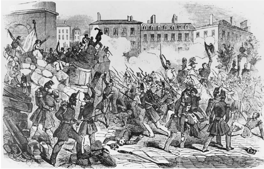
A barricade in France during the Revolution; the real battle, throughout, was between those who wanted to follow America's path as a constitutional republic, and those who played the British game of revenge upon the French state and the French nation.

(these are his expressions that I remember very well) that not even a mouse could escape.”