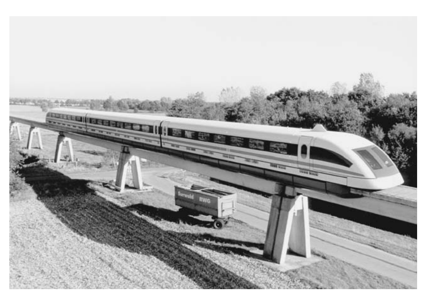
Magnetically levitated trains fill the bill, in every respect, for the new high-speed North American rail corridors, which are finally breaking into the open in Congressional debate. Here, the Transrapid maglev is tested in Germany, which is constructing such lines for China.

Lyndon LaRouche has described this kind of denial by policy makers, as worse than the economic crisis itself.