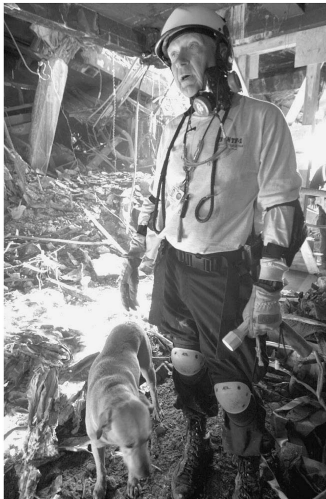
A rescue worker at the Pentagon on Sept. 14, 2001. Those who put their lives on the line, during the events of Sept. 11, expressed the meaning of their life, for the purpose of doing good.

LaRouche: I think so. I do. But, in this way, not in some fantastic way, some mythical way. You find in yourself a passion to do good, and you recognize that. You know, the wonderful thing about Kepler was, and I've pointed this out to many people many times, about his use of the word "intention," in describing the characteristics of the planetary observations which led him to the discovery and definition of the principle of gravitation. He described it as an intention of the planet, which could not be explained by statistical study of the behavior of the planet. Intention , which is another word for passion .