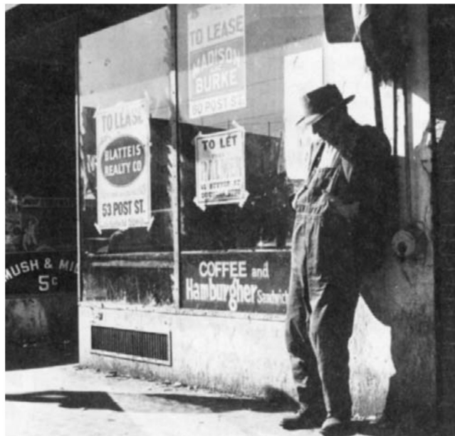
When President Franklin D. Roosevelt assumed leadership on behalf of the “forgotten man,” “suddenly, people who had gone gray, with the effects of depression, picked up their eyes, and said, ‘Someone cares.’”