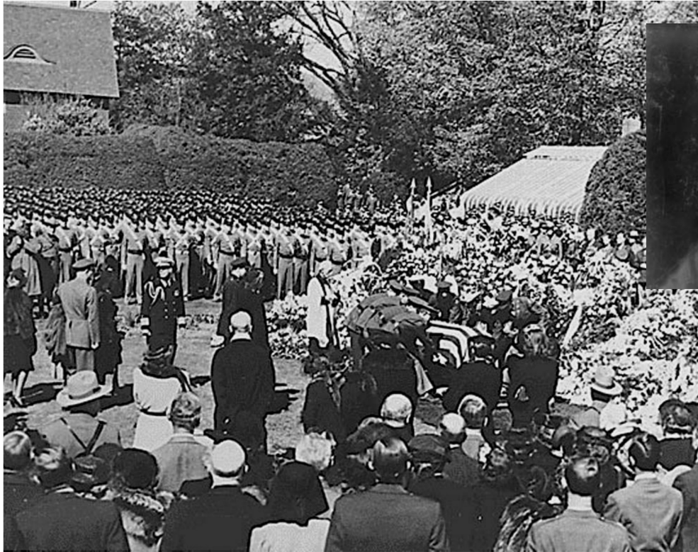
Roosevelt's funeral at Hyde Park, April 15, 1945. LaRouche, then in India in military service, was asked by fellow GIs what the significance of Roosevelt's death would be. "I'm afraid for our nation," he told them. "I'm afraid for the effect of turning the government over, from a great man, to a very little one."