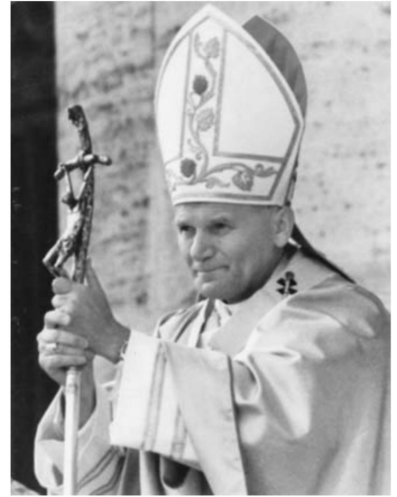
Left to right: Moses Mendelssohn (1729-1786), Iranian President Mohammed Khatami, Pope John Paul II. The three represent the ecumenical commonality among Judaism, Islam, and Christianity, which makes possible a “dialogue of cultures” —rather than Samuel Huntington’s “Clash of Civilizations.”

what the first Book of Moses, the first chapter of Genesis says, man and woman made equally in the image of the Creator of this universe.