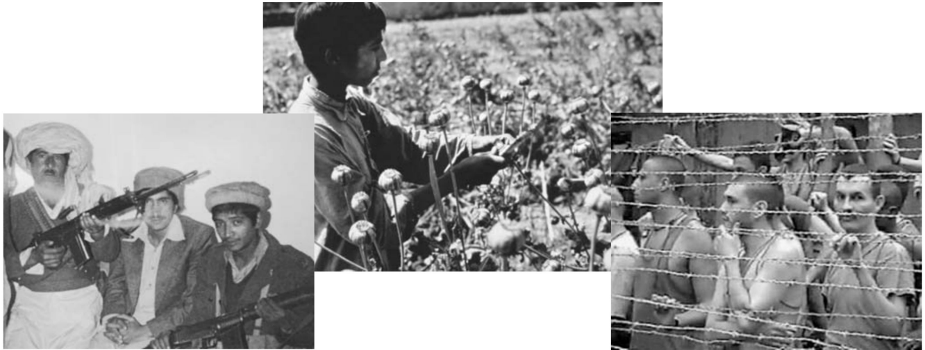
The rag-tag of international mercenaries and terrorists lives, financially, on illegal weapons-trafficking and drug-trafficking. Left to right: Afghan "freedom fighters," opium production in Pakistan, and prisoners held by the Colombian FARC narco-terrorists.

what happened to the United States, on Sept. 11 — if you view, at least the technicalities that are well-known —