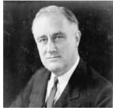
“How should we now assess the past, and possibly continuing role in world history, which the American Revolution of 1776-1789, and of Presidents Abraham Lincoln and Franklin Delano Roosevelt, continues to represent, even under the present conditions of threatened descent of the world into a new dark age of humanity?” Left to right: Benjamin Franklin, during the drafting of the Declaration of Independence; Lincoln; Roosevelt.

adopt, and implement the specific kinds of clearly defined measures, which are needed to free their nations from the monetary-financial policies which have brought the planet as a whole to the brink of chaos.