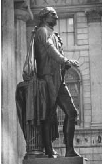
General George Washington was targeted by Samuel P. Huntington in his book The Soldier and the State , in an effort to rally contemporary utopians for a form of government, by beasts, reigning over hunted or herded human cattle.

moral authority to lead other nations, unless it is as zealously devoted to the general welfare of the community of nations, as to its own. This quality of government, the general-welfare principle, which was adopted as the fundamental constitutional law of the U.S.A., in the Preamble of the Federal Constitution, defines the only moral form of government. This is a form of government which has repudiated such abominations as the Roman Empire; whereas, contemporary U.S. utopians, such as Zbigniew Brzezinski and Samuel P. Huntington, base their perverted model of soldier and state, on their intention to establish a form of government, by beasts, reigning over hunted or herded human cattle.