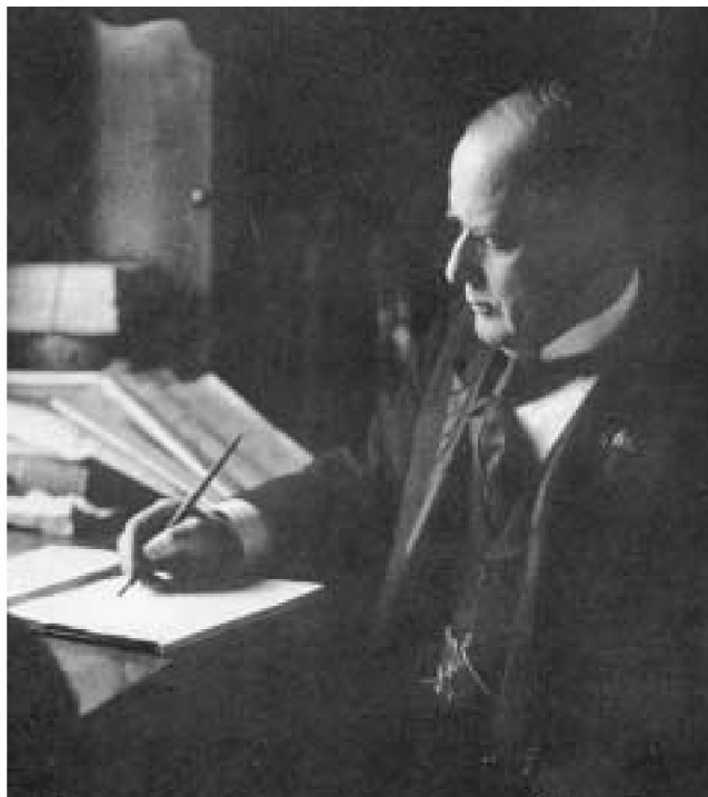
The most significant blow against civilization in general, was the assassination of President William McKinley (shown here) in 1901, which put Theodore Roosevelt into the Presidential mansion.

So, the great poet and tragedian, Friedrich Schiller, looking at the horror of the Jacobin Terror in France, said of France, “a great moment has found a little people.” The narrowness and the short-sightedness of a popular opinion obsessed with what it perceives to be its most immediate and short-term interests, is that form of moral mediocrity which is the most frequent cause of the horrors which a nation may