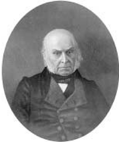
The American intellectual tradition: John Quincy Adams, as Secretary of State, defined the conception of a community of principle among a multi-polar array of sovereign nation-state republics.

the Careys, Monroe, and John Quincy Adams, saved the U.S.A. from dismemberment; but, the expansion of slavery and the spread of the related forms of corruption typified by Martin Van Buren's and August Belmont's Democratic Party of Jackson, Polk, Pierce, Buchanan, and McClellan, were the principal political correlatives of the continued, combined moral and strategic weakness of the nation. This weakness prevailed up to the time of what has been justly called "The Second American Revolution," President Lincoln's great victory over the British monarchy's puppet, the Confederacy.