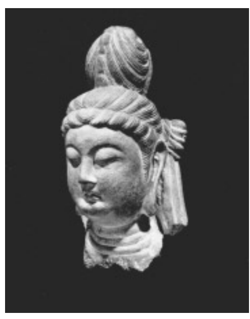
Statues of Boddhisattva from the T'ang Dynasty in Seventh-Century China.