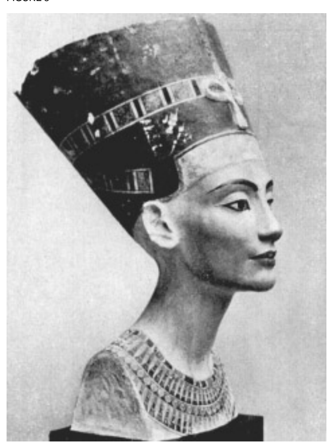
Bust of Queen Nefertiti, from 1340 B.C.

in Berlin. And, as you can see, this has an unbelievable beauty, which obviously reflects the soul of the artist. Anybody who created this, in 1340 B.C., must have had an image of man, which was just incredibly beautiful. There is even a little sign in the museum in Berlin, that this fits today's ideal of beauty.