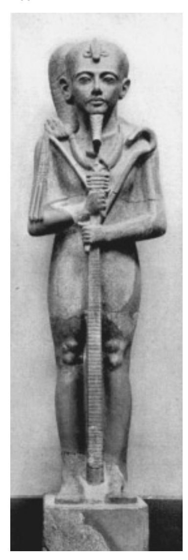
King Tutankhamen, statue from about 1325 B.C. A gold mask of the King, when it was first shown at the British Museum in 1817, caused a world sensation because of its beauty, overturning prejudices about what en

it broke with the cyclical idea of nature, and prepared the ground for the limitless perfection of man in the image of God. But, politically, the idea that man was in the image of God, was not yet realized, because the Roman Empire was an empire based on the oligarchical power-elite and a mass of slaves.