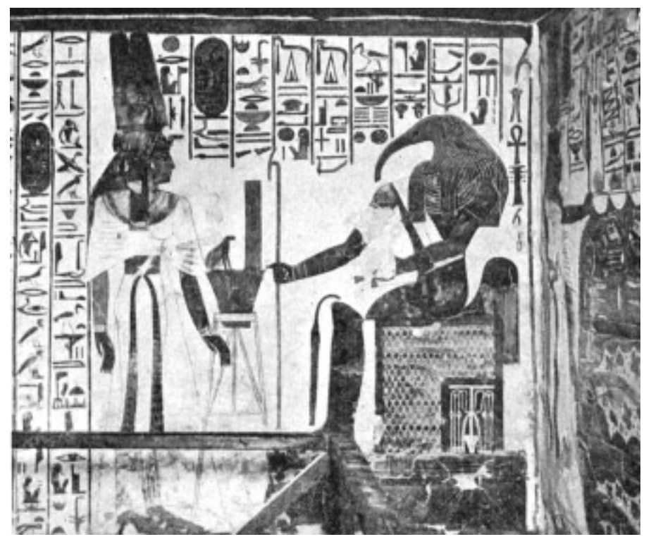
A relief from the Egyptian 19th Dynasty, during the reign of Ramses II.