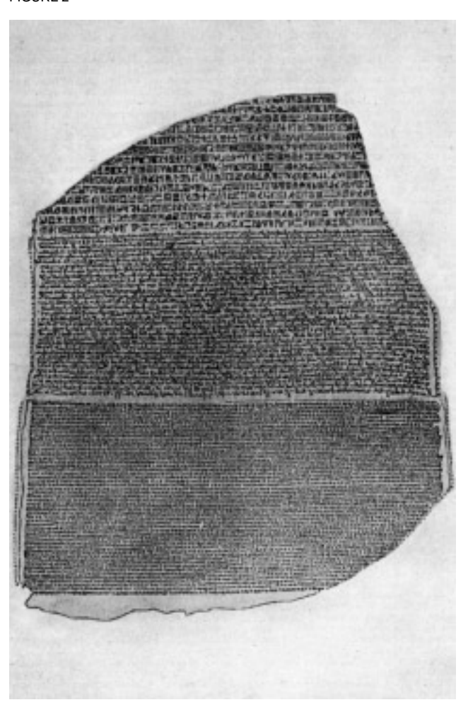
The Rosetta Stone, from the Ptolemaic Kingdom in 196 B.C. The stone contains the same text in Greek, in the Demotic language, and in hieroglyphics—which made it possible to decipher the hieroglyphics for the first time.

literature almost never mentions the Egyptian background to these ideas. It is quite something.