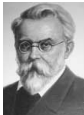
Vladimir I. Vernadsky

Indeed, this seems to hold true for isolated animal species