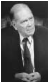
EIR Contributing Editor, Lyndon H. LaRouche, Jr.

gives subscribers online the same economic analysis that has made EIR one of the most valued publications for policymakers, and established LaRouche as the most authoritative economic forecaster in the world.