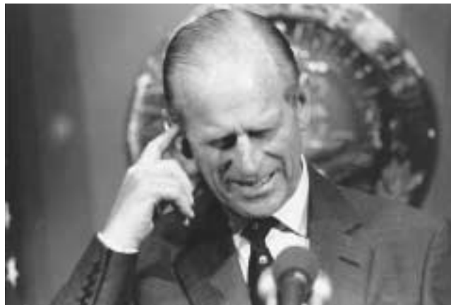
Prince Philip, who vowed that he would like to be reincarnated as a virus so as to help solve the “over-population” problem.

not need to access any difficult know-how, but need only to learn the use of a keyboard. In May 1969, the United Nations published World Population, a Challenge to the United Nations and Its System of Agencies .