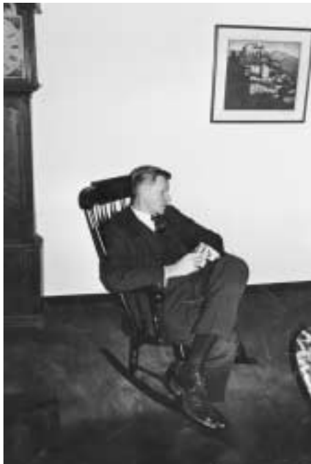
Zbigniew Brzezinski in 1975, before becoming Jimmy Carter’s National Security Adviser. Brzezinski continued the Malthusian policies introduced by Henry Kissinger during the Nixon Administration.

Henry Kissinger, with his National Security Study Memorandum 200, which denounced population growth in the Third World as a “national security threat” to the United States, and laid out a classified strategy for grabbing the raw materials of those nations, on behalf of an English-speaking world empire.