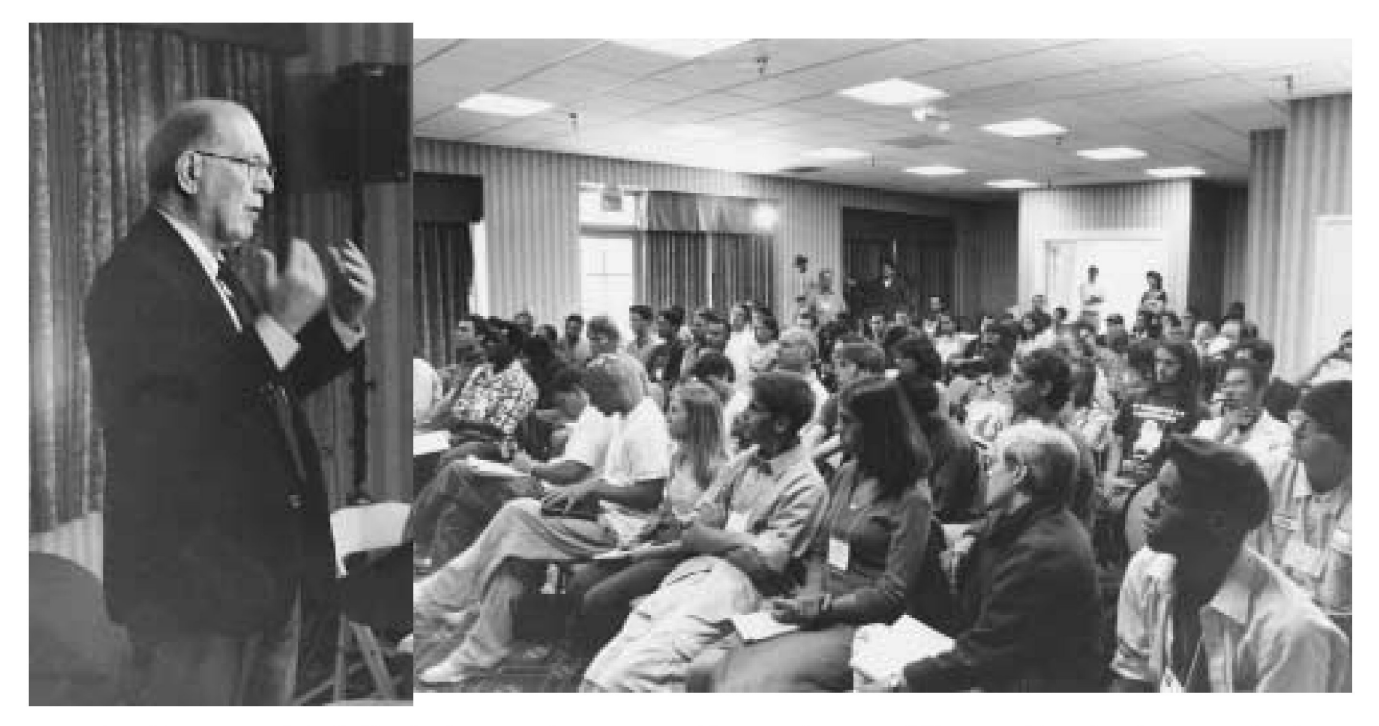
LaRouche told young people in California: "You must intervene as a citizen, to take responsibility, as a citizen, for what your nation does. And, we have a Presidency. We have the finest Constitution ever devised, so far: Use it!"

It was not justified. We also have the rail system, and the Congress and the President are prepared to abandon the rail system, largely. Privatize it, which means that only one person can use it, or something of that sort.