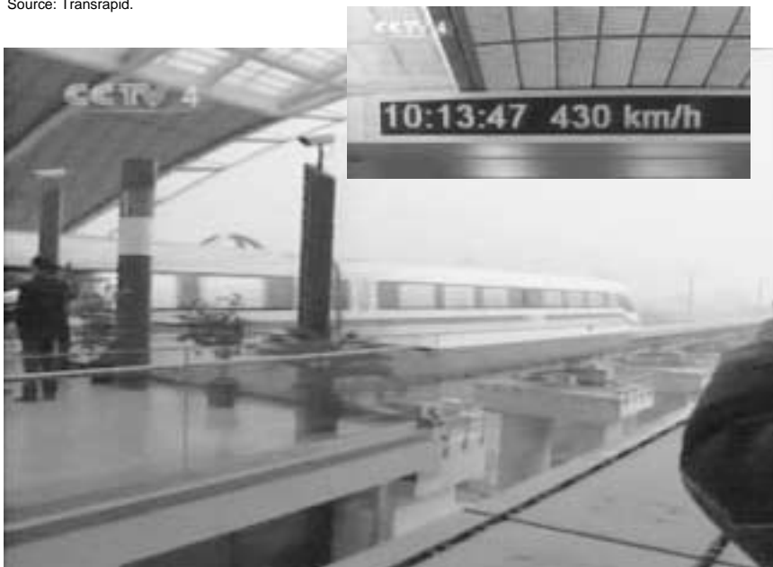
The world's first "maglev" train leaves Shanghai on Dec. 31, 2002. The maps show the Shanghai route to Pudong Airport, and the longer projected maglev lines being planned by China and Germany, whose Siemens and ThyssenKrupp firms developed the Transrapid technology. On board speedometer (inset) shows the 260 mph speed reached by the train.

mensely, to make an acceleration of the project possible with new construction methods. In the future, more and more, if not all, of the maglev trains will be manufactured in China itself. And, maglev experts on the German and Chinese side have already portrayed a future in which maglev trains will be built throughout Asia, and worldwide,