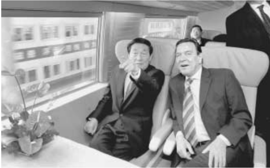
China's Prime Minister Zhu Rongji points out the Transrapid magnetic-levitation train's velocity display to German Chancellor Gerhard Schröder, on its New Year's Eve maiden trip from downtown Shanghai to Pudong Airport. The "maglev" reaches 215 mph on this, the world's first such rail line. Schröder's message spoke of Germany's contribution to international stability and development with its technological skill used for building at home and across Eurasia.

lieve that even if the funds were secured, it were virtually impossible to complete such a technologically ambitious project in Germany, because of bureaucracy and "environmentalist" sabotage; but recent Elbe River floods showed this to be untrue. A crucial railway bridge at Eilenburg, in the eastern German state of Saxony whose infrastructure has been devastated by the big August 2002 floods, was partially rebuilt within only 36 hours! The restored section of that bridge again allows one-line transfer between the cities of Leipzig and Dresden. The Eilenburg project worked because the German government had decreed that flood-devastated regions could be rebuilt in record time, bypassing the usual bureaucratic and extreme ecologist procedures. After removing the destroyed old railway bridge, engineers from all parts of Germany formed a crash project team that restored half of the bridge with prefabricated components "overnight." The example shows what is possible when aspects of military engineering are applied in the civilian economy.