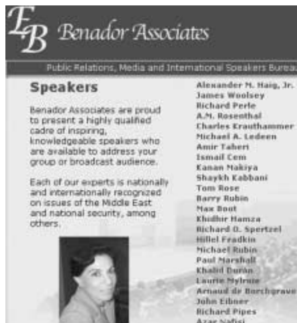
Virtually all figures who have insisted on Iraq's weapons of mass destruction, excepting high U.S. government officials, are clients of one New York public relations firm.

In the former Soviet Union, the job of Benador Associates would have been known as "agit-prop," that is, "agitation