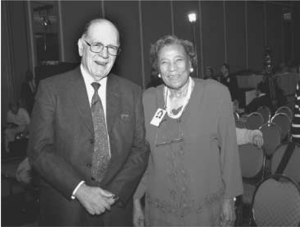
Lyndon LaRouche with civil rights heroine Amelia Boynton Robinson, vice president of the Schiller Institute. Her and LaRouche's appearance at a Talladega, Alabama commemoration of Martin Luther King Day on Jan. 19 is being discussed all over the country; the DVD of LaRouche's presentation, "The Immortality of Martin Luther King," is circulating in the thousands.

was done under Truman. And it was done under the Harriman crowd, the same Harriman crowd, who had been part of the forces that had put Hitler into power in Germany in the first place! The right wing had taken over America.