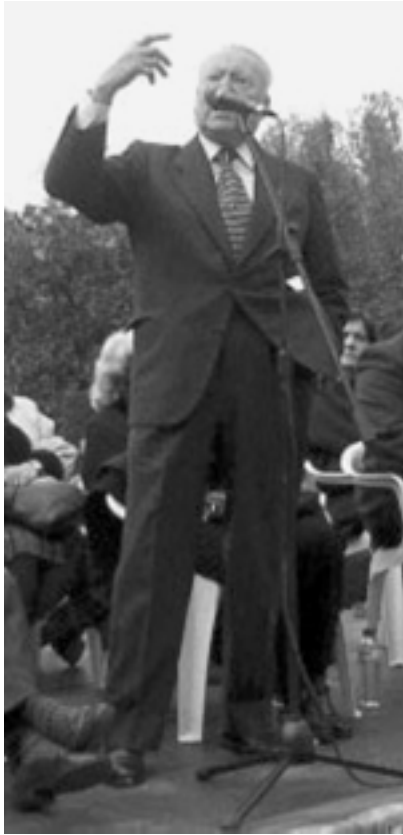
Spain's leading fascist figure, Blas Piñar. "Assess the potential for a relevant type of 9/11 attack on the U.S. which would be traceable to Blas Piñar, as 9/11 was traced to Arabs."

staged the terrorist attack of Sept. 11, 2001. Otherwise, without that attack, he would have been, still today, the surly ape shuffling restively in the Vice-President's cage.