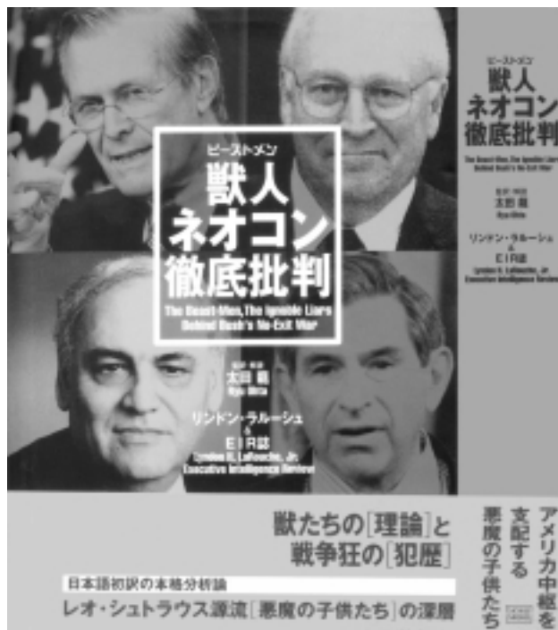
Neo-Con Beast-Men: The Ignoble Liars Behind Bush's No-Exit War —on sale now in Japan, and "selling like rice cakes," according to the publisher.

The "No-Exit War" in Iraq has made many see that these crises are caused by the global economic and military failures of the Neo-cons in Washington, starting with "Nixon Shock" in 1971, when Dick Nixon bankrupted the Bretton Woods monetary system. A non-violent peace movement against Cheney's "permanent war" is growing in Japan. But can Japan find a real exit from the hopeless world the neo-cons have made, by creating positive new programs to build its way out?