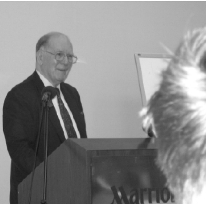
LaRouche: "We shall only get out of [this crisis] if we have a Presidency which responds to this crisis, according to the same principles that Franklin D. Roosevelt used in March of 1933. Otherwise, there is no hope for the United States, or for the world in general. Roosevelt just before his March 1933 radio address announcing a reorganization of the nation's banks and suspension of gold payments.

based on the Greater New York market. The mortgages are rising. What do they employ? They employ cheap labor, unskilled labor, to produce shacks—which we used to call tarpaper shacks, years ago. Now, they're made with chip board—that's the good quality, actually. And, essentially tarpaper shacks, with a few gold faucets in them (maybe); plastic exterior; and a $400,000 to $600,000 mortgage.