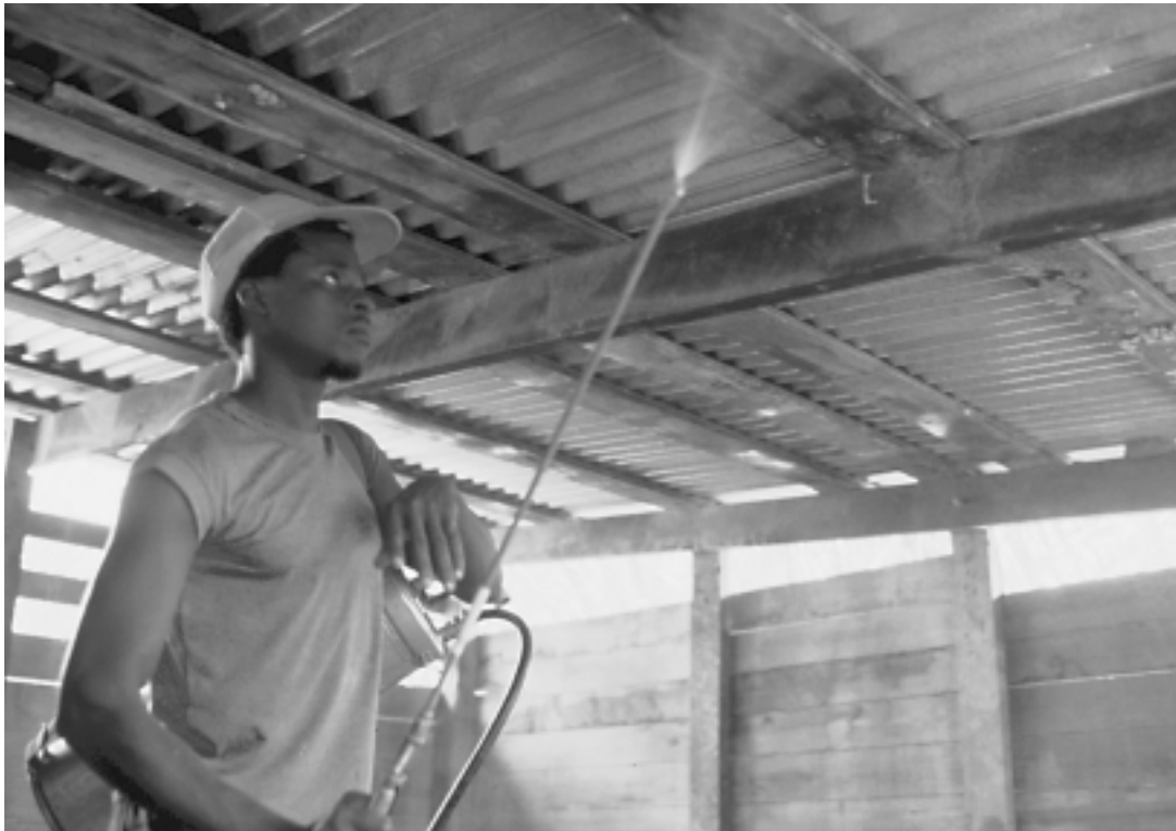
Anti-malarial spraying in Guyana. The British medical journal The Lancet reported that no adverse effects of DDT were ever experienced by the 130,000 spraymen or the 535 million people living in sprayed houses during 1959.

backing the indoor spraying program, and slamming the latest permutation in the DDT scare stories, that DDT lowers sperm levels and quality. The statement notes, “We believe that the Department of Health is correct in its choice of DDT in its malaria control program, and as scientists, medical practitioners, and public health professionals, endorse its use.”