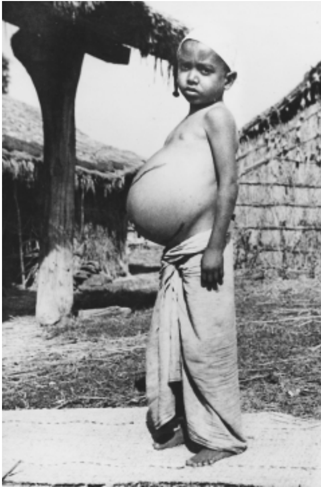
A typical malaria victim in 1950, before DDT was widely used. The child's spleen is enormously enlarged, one of the symptoms of malaria infection.

American markets where organic food products fetch exorbitant prices.”