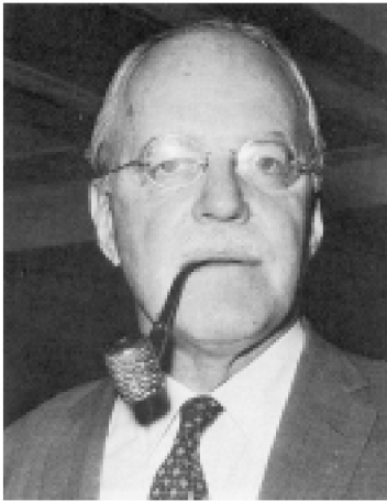
Allen Dulles, first of the OSS, later of the CIA, typifies those who played a key role in bringing a key part of the Nazi SS intelligence apparatus into what later became the NATO system.

ist elements, were collected to form a combination of other Continental European fascist networks, and were integral to the Franklin Roosevelt-hating, Anglo-American networks associated with Henry Luce's already existing project for "A New American Century."