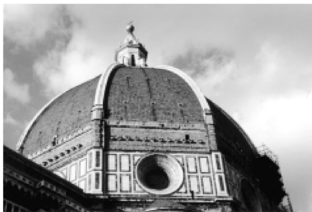
Brunelleschi's cupola of the Cathedral of Florence, one of the Renaissance's monumental achievements. In the shadow of the dome, "the bestializing legacy of empire gave way to the notion of a community of sovereign nation-states each and all committed to promotion of that general welfare of mankind."

those principles of civilized relations among sovereign nation-states which were adopted by the 1648 Treaty of Westphalia.