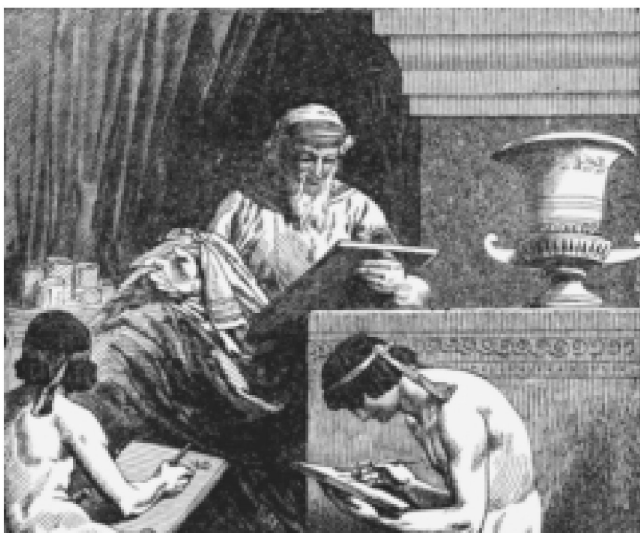
Solon, the lawgiver of Athens, in the Sixth Century B.C., initiated the long historical struggle to establish a true nation-state republic, in opposition to the effort typified by Sparta under the Constitution of Lycurgus.