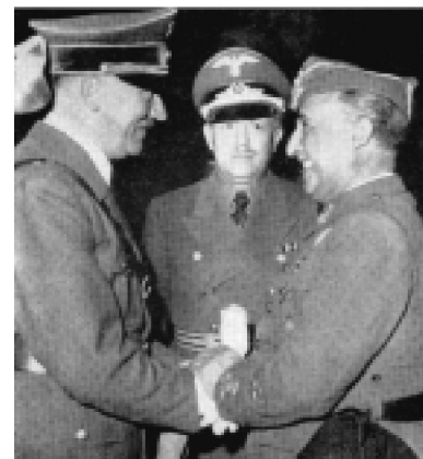
The same Synarchist International that created Hitler, Mussolini, and Franco (Hitler is shown here with Mussolini on the right, and with Franco on the left) also produced that subversive enemy of ours who later appeared under such significant labels as the Congress for Cultural Freedom (CCF); the evil was expressed both as fascism and as the philosophy of the CFF promoted by followers of Allen Dulles.