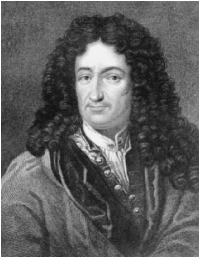
Gottfried Leibniz, one of the greatest philosophers and statesmen of all history, forced the Newtonians into a momentous debate on the nature of man, God, and the universe. Newton put forward his mouthpiece Samuel Clarke for the combat, rather than daring to take on Leibniz personally.

by an extraordinary concourse, and even to mend it, as a clockmaker mends his work; who must consequently be so much the more unskillful a workman, as he is oftener obliged to mend his work and set it to right. According to my opinion, the same force and vigor remains always in the world, and only passes from one part of matter to another, agreeably to the laws of nature, and the beautiful pre-established order. And I hold, that when God works miracles, he does not do it in order to supply the wants of nature, but those of grace. Whoever thinks otherwise, must needs have a very mean notion of the wisdom and power of God.” 7