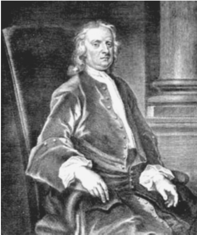
This portrait of Isaac Newton by John Vanderbanks (1725) formed the frontispiece of the third edition to Newton's Principia . The American scientist James Logan remarked that the picture would "be considered rather as an object of Ridicule than Respect, & much sooner raise Pity than Esteem."

cally, as the interaction of self-evident bodies; all philosophical or "metaphysical" hypotheses are banished from science.