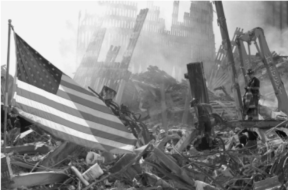
The World Trade Center. "Unfortunately, there is no competent definition of the concept of strategic long-range mission in the general discussion of the matter of intelligence reform among official circles, and national press, today. That is the source of the intelligence failure which underlies both the lack of preparedness prior to Sept. 11, 2001, and the apparent inability to comprehend the motive forces behind, and global historical implications of that calamity."

up the fact of an already onrushing build-up toward early general collapse of the entire world monetary-financial system.