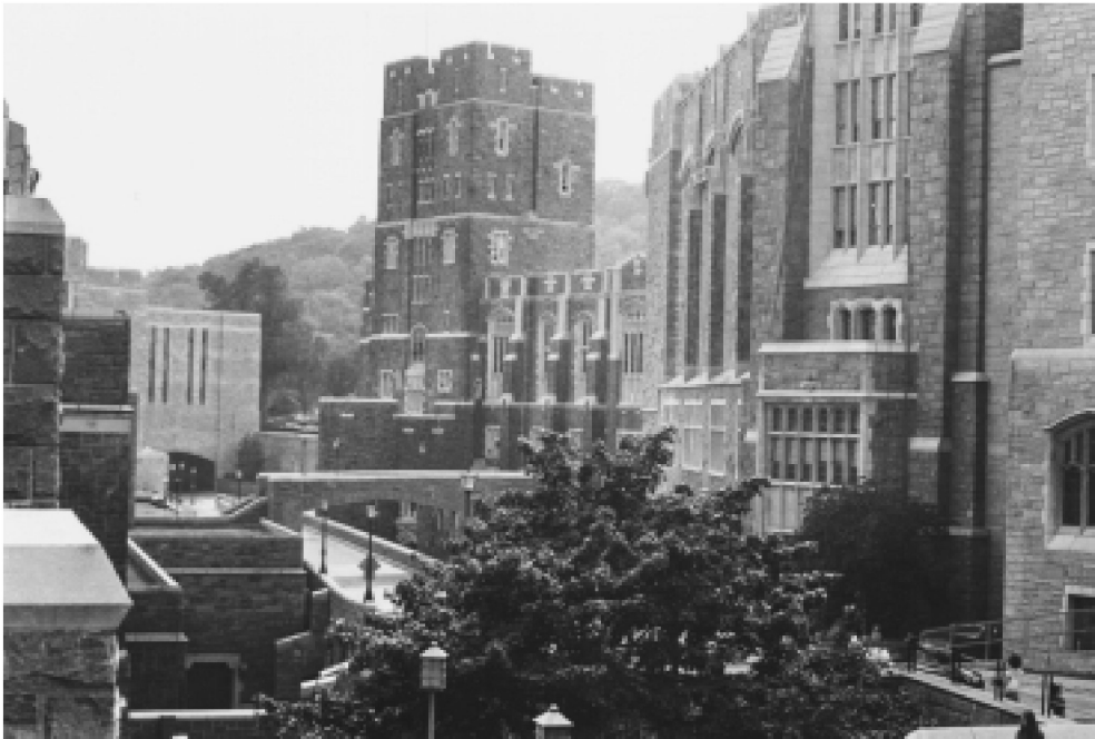
The axis of the functioning of a reformed intelligence system, LaRouche writes, must be a newly established national intelligence institute, comparable to the original intention of the West Point (shown here) and Annapolis Academies.