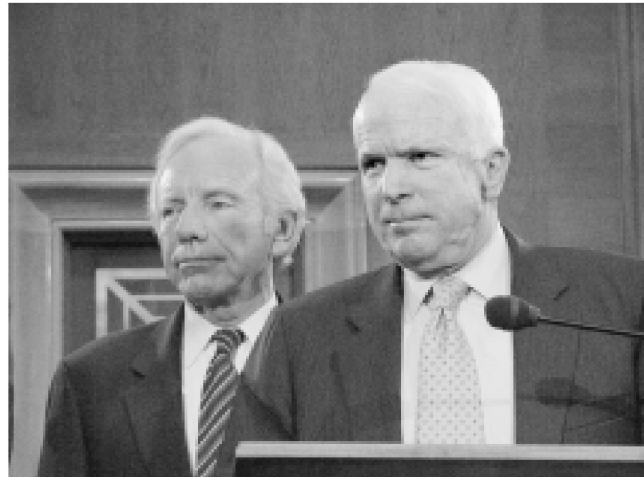
Senators Joe Lieberman (D-Conn.) and John McCain (R-Ariz.), at a Sept. 7 press conference in Washington, announcing legislation to implement recommendations of the 9/11 Commission. Writes LaRouche: "Isn't there something very sadly wrong about the current obsession with rushing to jam through half-baked remedies of intelligence reform, remedies which are already worse than what is proposed to be the disease?"

My warning of the likelihood of such a plot, had been premised upon my studies of the way in which that dark cartel, the financier-oligarchy-controlled Synarchist International of the 1919-1945 interval, had orchestrated the wave of fascist takeovers of the nations of Western and Central continental