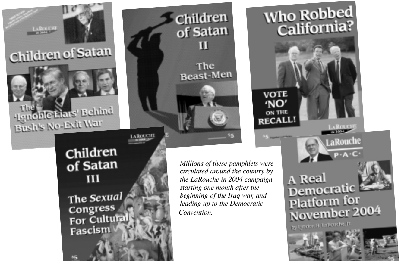
Millions of these pamphlets were circulated around the country by the LaRouche in 2004 campaign, starting one month after the beginning of the Iraq war, and leading up to the Democratic Convention.

basic precepts that led the nation into war. And that it was based on those lies, Kerry said, that he voted for the war. He called a press conference—by then he was a Presidential candidate; he called a press conference, and everybody expected, including his own staff, that he was going to identify Cheney’s lies! But, that’s not what he did: He attacked George Bush in the press conference, based on advice from his advisors. It was bad advice. It was very bad advice. And it actually allowed Cheney to remain in office.