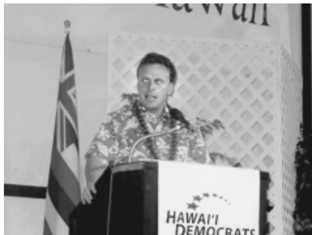
Democratic National Committee Chairman Terry McAuliffe, whose election strategy is: “We don’t intend to just mobilize soccer moms. We’re going to mobilize SUV dads.”