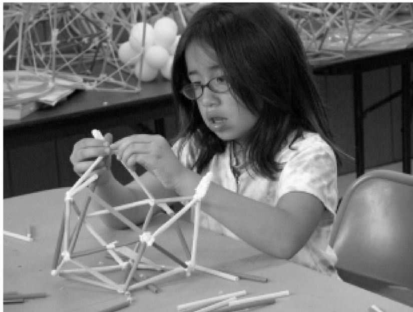
The Greek study of "spherics" had its origins in astronomical investigation, and led to the development of constructive geometry—not the fixed axioms of Euclid. The LaRouche Youth Movement has made this the core of its scientific pedagogy. Here, a youngster constructs the Platonic solids at the Schiller Institute Summer Camp in Leesburg, Virginia, July 2004.

So, these are the kinds of experiences which give mankind a sense of what kind of a universe we're living in: Mankind, looking to the stars, sees us, on this planet, in the universe. And the way we see what we see, when we look at the stars, or the movement of the planets, we see a universe in motion; with certain things which are relatively fixed, periodically fixed motions, and some things that are a little bit more irregular. And from studying the problems of both the combined fixed motions and irregular motions, and the coincidence of these changes in motions upon the conditions of life inside places such as Egypt, such as the setting of the times of the Nile—crucial turns in the Nile, were associated with certain astronomical positions of certain stars—they developed a concept of spherics, in which they made no Cartesian assumptions, no Euclidean assumptions! The universe we're living in, is a giant spheroid, and we're observing spheroid-like motions, within this area. This, then, becomes the notion of universality : a kind of universality which you know, not because you assume it's true, but because it's demonstrably true, as in the case of these astronomical observations. And therefore, you say, "What determines our life in this universe , this universality, are those things which can be expressed within assuming that the action's occurring in a form, which is charac-