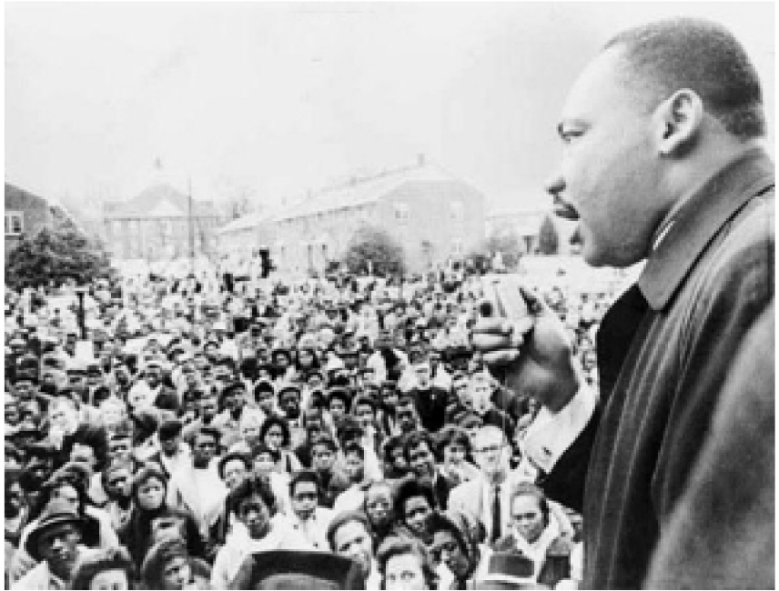
Dr. Martin Luther King, Jr. addresses supporters after the Bloody Sunday march in Selma, Alabama, March 7, 1965. King was not a “practical” man, but a great man. On the night before he was assassinated, he profoundly expressed his conception of his own mission and his immortality: “I’ve been to the mountaintop.”

And our identity, our sense of what our function is, as a living person , is to take ourselves out of this childish state, of