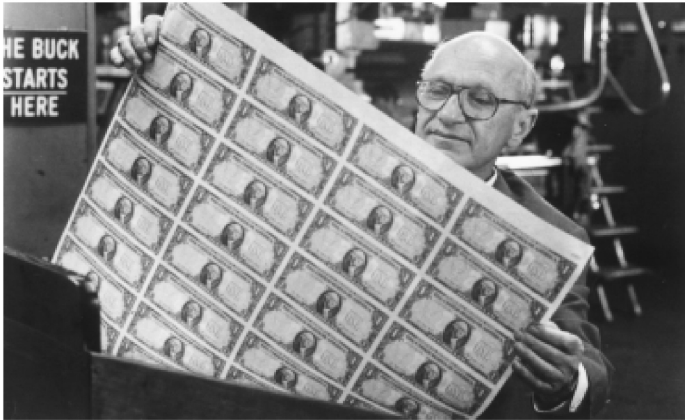
Monetarist guru Milton Friedman. "The greatest single prison in the mind of the American people," said LaRouche, "that makes slaves of most of them, is this damned belief in money—the god, Money."

dent king of society, they believed that money was the power to purchase, and to enjoy purchasing. Whether you enjoyed the product you purchased or not was a matter of indifference: The power to purchase was what was important. You might complain about the result, but you still would do the same thing. The Great American Consumer was the biggest sucker in the world.