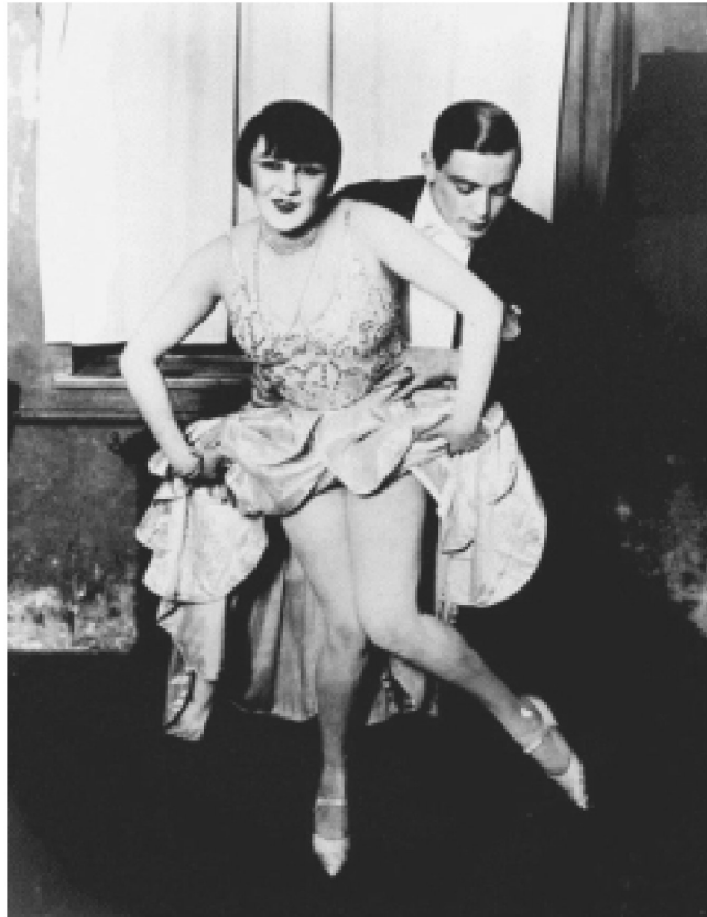
The corrupt “Charleston generation” of the 1920s had their degenerate fantasy-world blown apart by the Crash of 1929-33, under President Hoover.

And, the way the culture is presented, the corruption is presented, it's presented in the form of money. The characteristic of the Baby-Boomer generation, in particular, unlike the