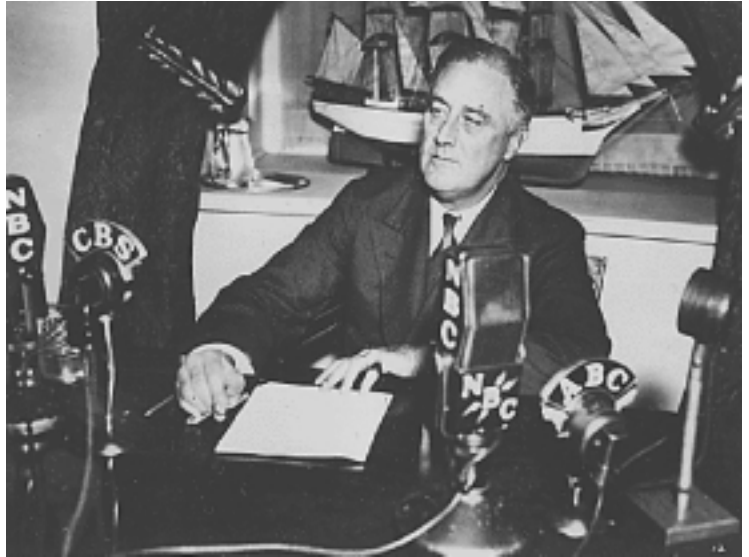
President Roosevelt delivered the speech containing his Economic Bill of Rights through a fireside chat in January 1944.

There is one major problem with the Wall Street argument, Sunstein asserts: It’s just not based on reality! In support of this, he cites the school of “legal realism,” which argues that there is no such thing as the free market, and that the only reason that so-called private enterprise, or property owners, can expect to enjoy the fruits of their endeavors is that they have rights created by the government. So, the question is not whether the government has a “right” to interfere with an