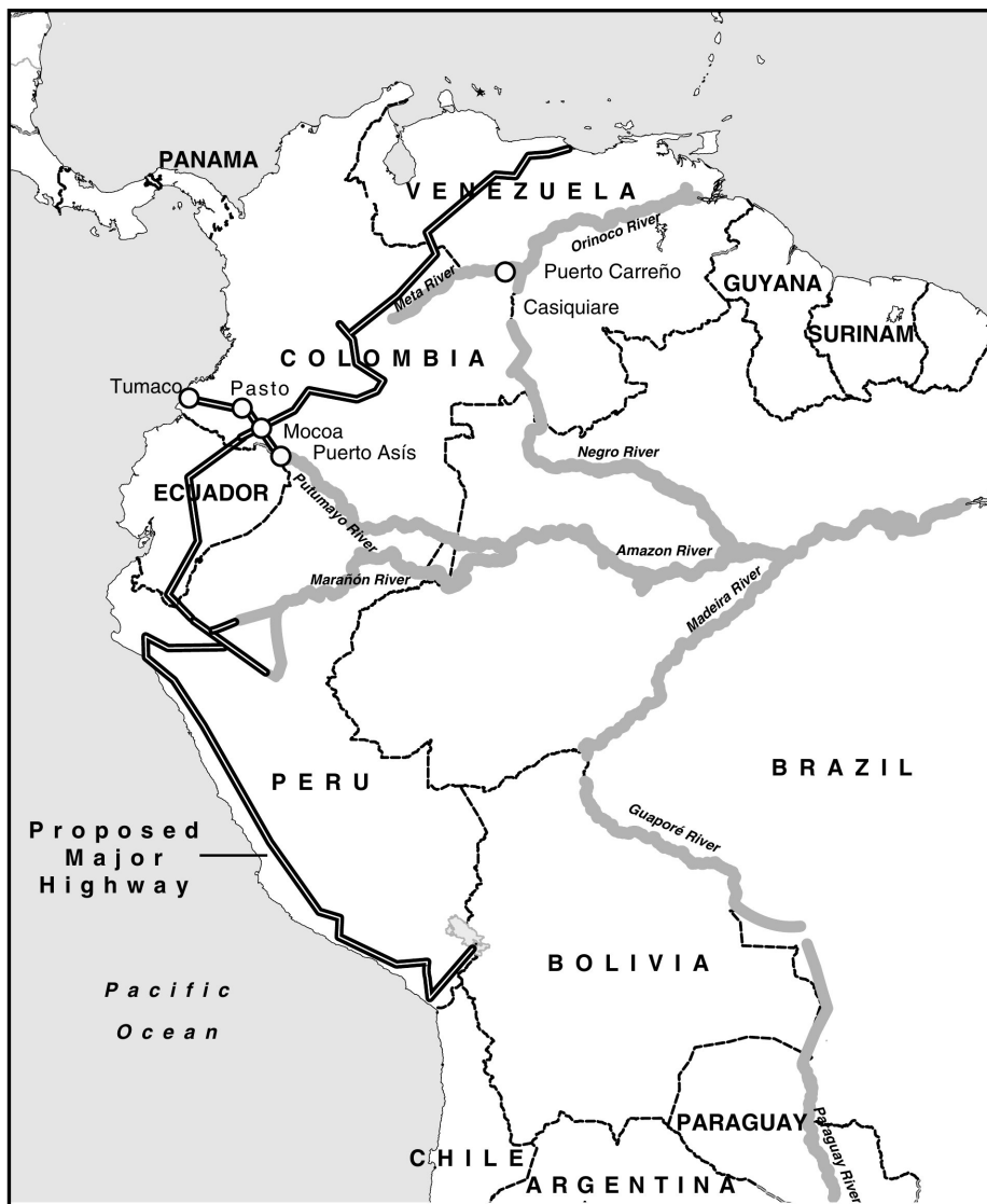
During a meeting in Venezuela on March 29, Colombian President Alvaro Uribe Vélez briefed his colleagues from Venezuela, Colombia, Brazil, and Spain, on development projects which could make the continent flourish. This map shows a few of them.

with their regimes, but on the basis of the long-term relationship with the nation and its people as such.