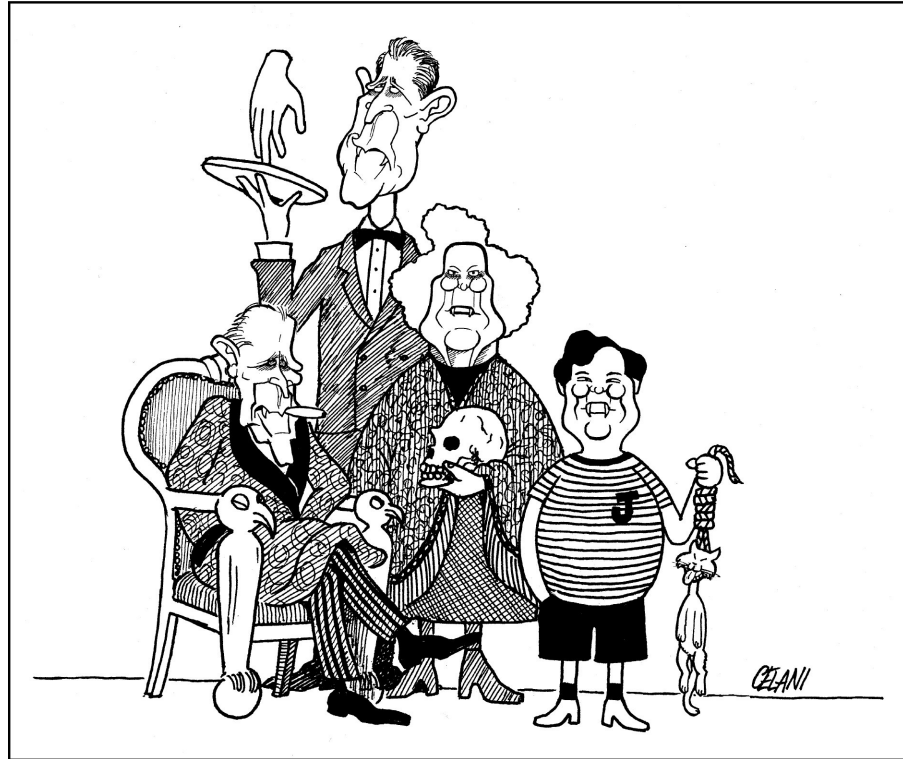
Bush Family Values

All right, these guys exist. I know they exist. I know who they are. That they will pull a Hermann Göring-style terrorist