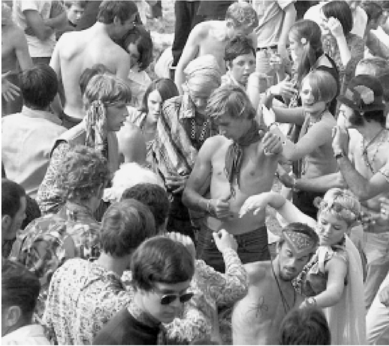
The 68er counterculture had its antecedents in pre-Nazi Germany: “What was the proposal? Shut down society. Go out on the street, take your clothes off, and fornicate with anything you find in the street. . . . We had countercultural phenomena in the 1920s, in Germany, for example, which was the key basis for building up the Nazis.” Here, Woodstock, 1969.