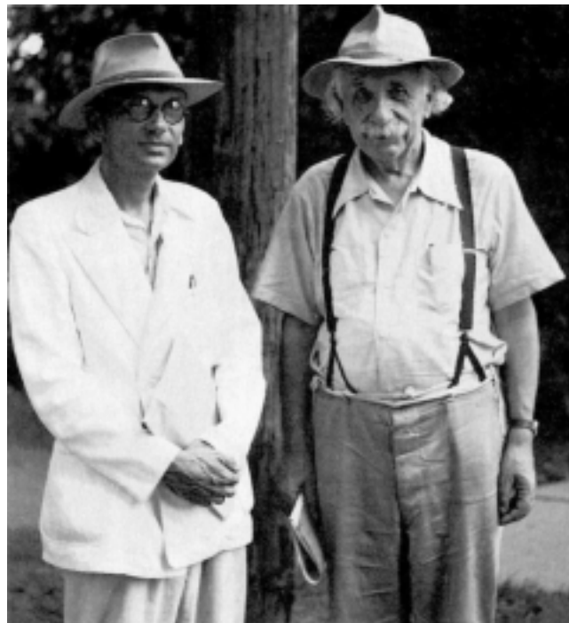
Kurt Gödel (left) and Albert Einstein. The two friends waged a life-long battle in defense of the Platonic scientific tradition, against the dominant ideology of empiricism and positivism.

Wittgenstein went to Cambridge to work with Bertrand