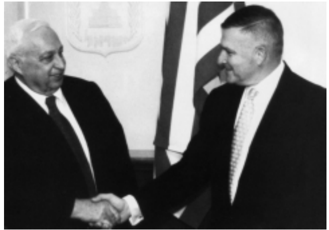
Palgrave Macmillan, The Battle for Peace

Recognized as a “Marine’s Marine,” General Zinni combines the unique qualities of a soldier-diplomat. He views the instability in many parts of the developing world as the underlying problem which fuels terrorist movements, not cultural differences. His goal is to deal with these underlying problems before they get to the boiling point. Here Zinni is shown with Palestinian National Authority President Yasser Arafat (left), and Israel Prime Minister Ariel Sharon (right), during his 2001-2002 efforts to mediate a peace settlement between the Palestinians and Israelis.